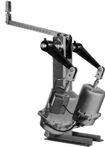
D-3240 Series Duplex Pedestal Mounted Actuator

These actuators are used where large amounts of positioning power from a single actuator, or high torque capabilities are required.