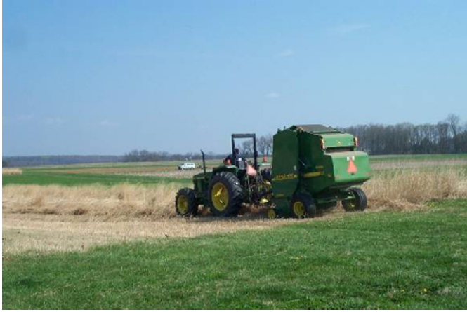
Fig. 1. Class 2 tractor baling hay.