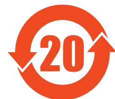
Table 5 Hazardous Substances

(Name and Content of the Hazardous Substances in Product)