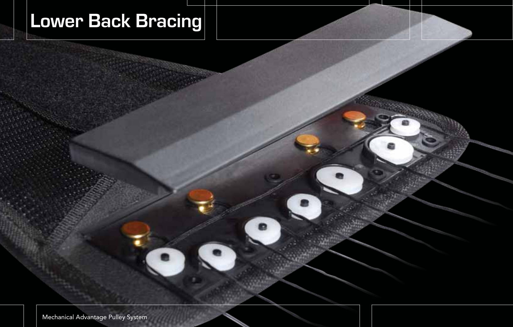
Mechanical Advantage Pulley System