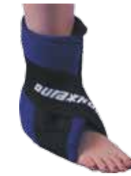
Foot & Ankle Wrap