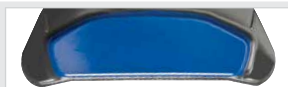
Featuring the Dual Durometer Butress System