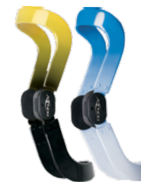
Combination of any 2 non-metallic colors only