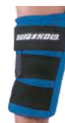
Arthroscopy Knee Wrap