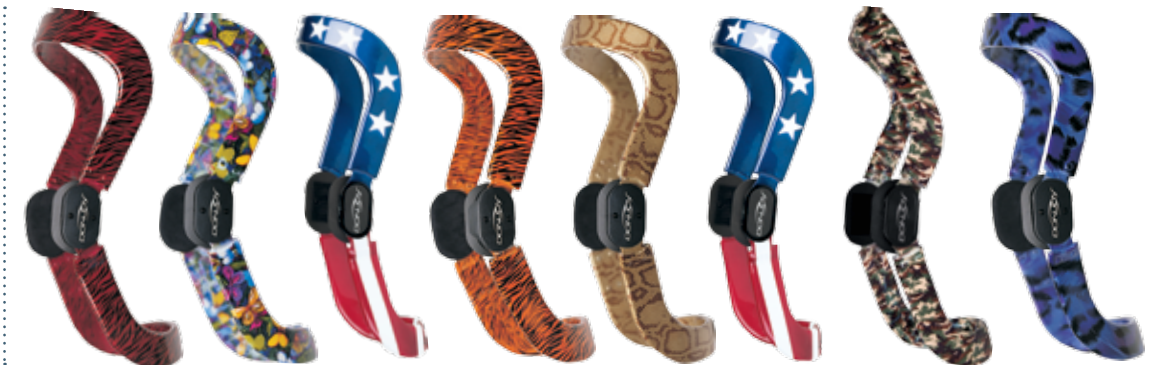
Tiger Red, Butterfly, Stars & Stripes Non-metallic, Tiger Orange, Snake, Stars & Stripes Metallic, Camouflage, Leopard Blue