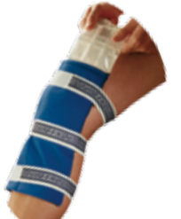
Surgical Knee Sleeve