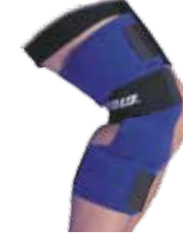
CPM Knee Wrap