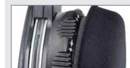
Off-loading adjustable hinge technology