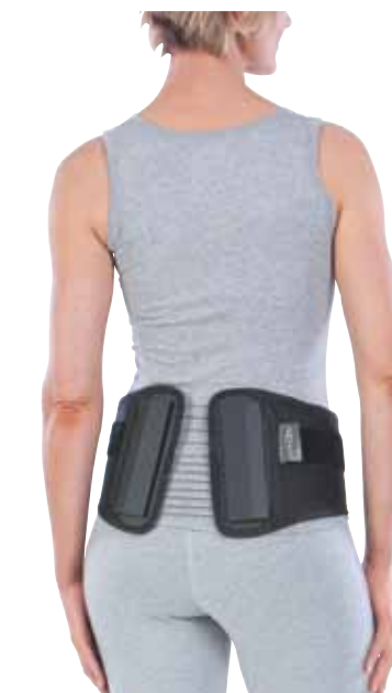
DonJoy Low Profile Back