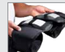
Lordotic Insert Accessory

Lordotic foam inserts fit easily into the posterior pockets of the DonJoy 8" and 10" braces.