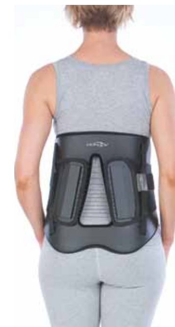
DonJoy LSO with Chairback (8")