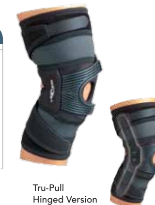
Tru-Pull Hinged Version