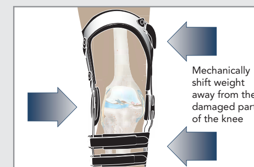
3-Point Load Off-Loading

Mechanically shift weight away from the damaged part of the knee