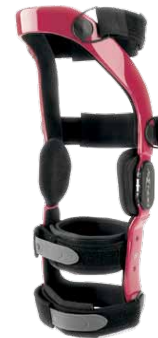
Swooping Medial Thigh