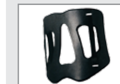
Standard Chairback Accessory