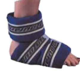
Surgical Foot Wrap