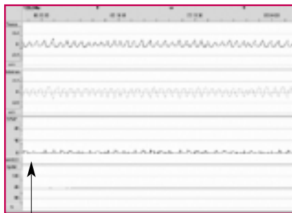
Figure 1: Under-ventilation

The Embletta (a small ambulatory diagnostic device) was presented to the team at the same time as the VPAP so they decided to monitor Nicole's ventilation at night using the volume ventilator. They were very surprised to see that although her \text{SpO}_2 was maintained at a reasonable level, she was not being ventilated (refer Figure 1). The next night they tried the VPAP using a nasal mask.