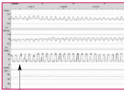
Figure 2: Adequate ventilation

Special thanks to Susan Sortor Leger for compiling this story.