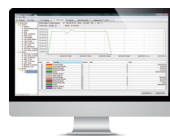
NetAtlas EMS NetAtlas Element Management System