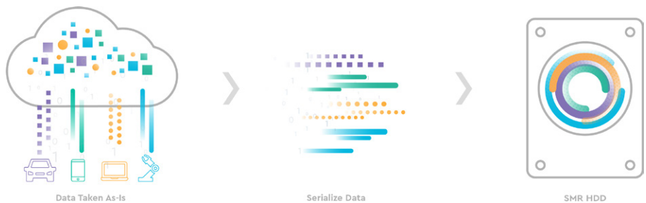
Figure 4: Serialized data written to HDD

Ultrastar DC HC600-series data center HDDs utilize Host-Managed SMR. Unlike Drive Managed SMR, Host Managed SMR promotes SMR management to the host to help manage the data streams, read/write operations and zone management. Another key difference from Drive Managed SMR is that Host-Managed SMR does not allow random write operations within each zone.