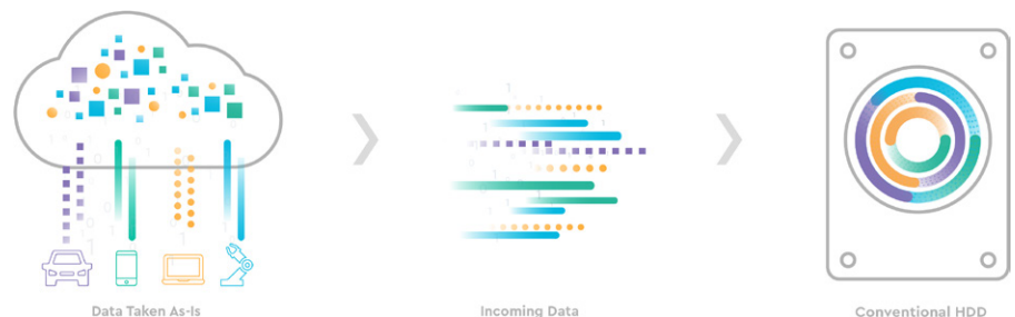
Figure 2: Unorganized data written to HDD

In addition, many hyperscale and cloud storage customers are now beginning to realize that their workloads are trending toward data that is written sequentially and rarely updated, as opposed to random and frequent reads. In these instances, customers seek storage solutions with the lowest overall TCO, i.e., power consumption, rack density and dollar per terabyte. These active, sequential workloads have the potential to create a new paradigm opportunity for innovative storage solutions.