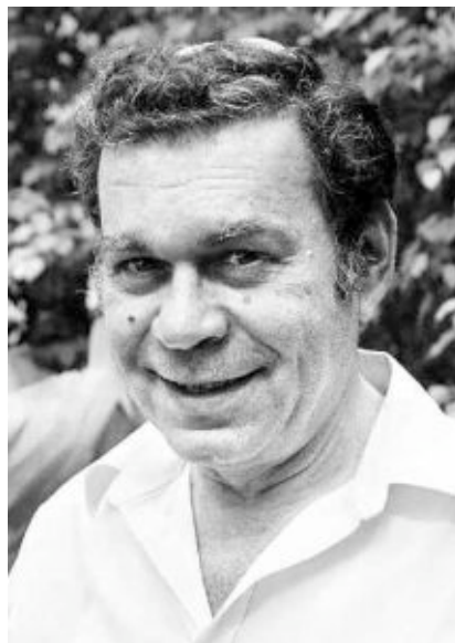
Dr. Eliyahu M. Goldratt

How I ended up at LSE is a bit of a story in itself. For those unfamiliar with the British educational system of back then, I attended a grammar school, supposedly (and in fact) a cut above the hoi polloi condemned to eke out a few years at the comprehensive school, thence becoming horny-handed sons of toil. At age 16 in grammar school we took our 'O' (Ordinary) level exams in up to 9 or 10 subjects (I passed seven of nine - how skiffy is that? - which actually made me the class thickie). You best 'O' level subjects determined your choice of 'A' (Advanced) level courses, of which at my school you usually chose three. Mixing it up somewhat, I took mathematics (pure science), economics (social science) and English literature (art). Eng Lit was always my best subject, and in my mind the likeliest candidate for a college subject,