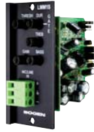
LMR1S with Remote Volume Control