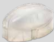
V.A.C. ULTA™ Canister - 1000ml