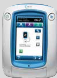
V.A.C. ULTA™ Therapy Unit