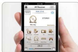
New iOS and Android apps