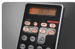
New LCD learning remote control