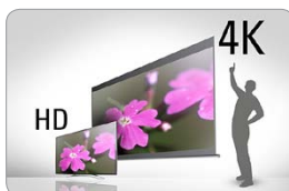
4K video support (Video pass through, video upscaling)