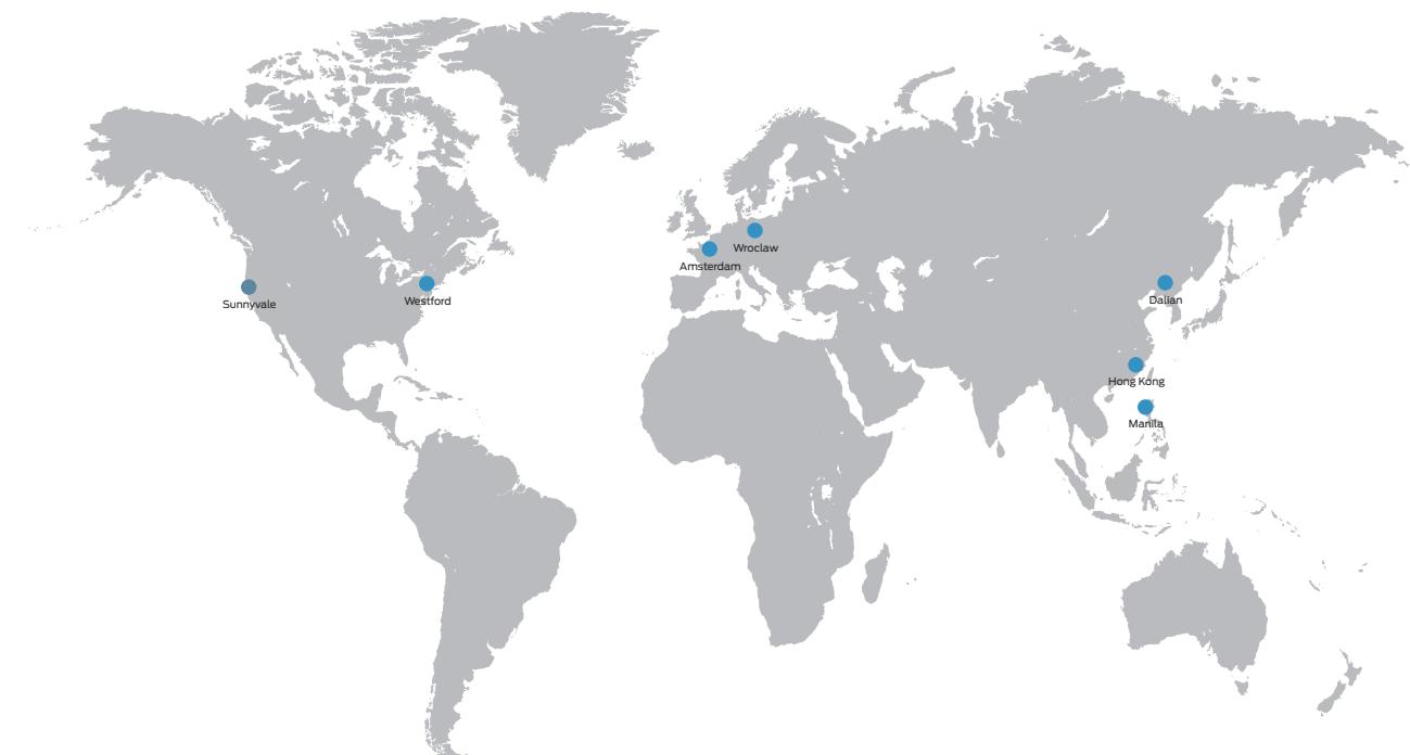
Figure 1: Global Customer Care

For non-English speaking customers, our Customer Care representatives can provide support in a number of languages such as Arabic, Dutch, French, German, Japanese, Korean, Mandarin, Polish, Putonghua, Russian and Spanish. They also have access to translation services to help facilitate communication in most other business languages.