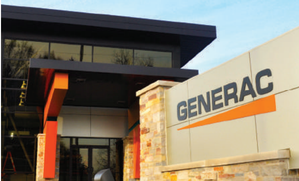
Corporate headquarters, Waukesha WI (above) Whitewater WI manufacturing facility (right)

Founded in 1959, Generac invented the home standby power category. Today our U.S. manufacturing facilities are state of the art, and our products lead the industry in quality, breadth of offering, and innovation.