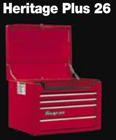
KRA4014D Top Chest (Also available for Heritage Standard 26)