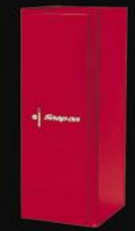
KRA5012D Locker (Also available for Heritage Standard)