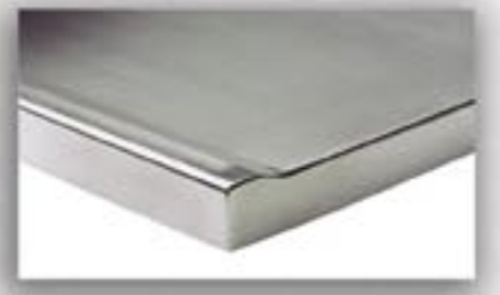
Stainless Steel Work Surfaces High grade 16 gauge 304 stainless steel with raised front lip to keep parts from rolling off workbench. Top is 17/8" thick.