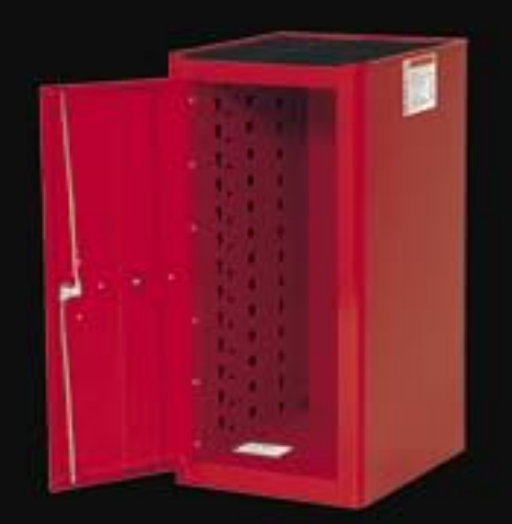
KRA4830 Bulk End Cab (Also available for Heritage Standard)