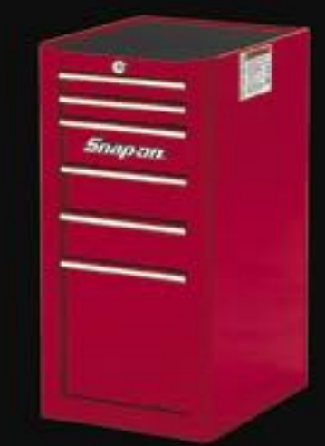
KRA4820D End Cab (Also available for Heritage Standard)