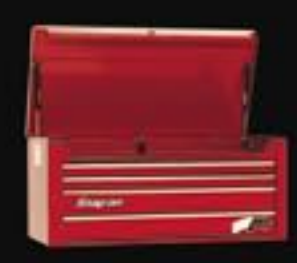
KRA2104A Top Chest (Heritage Standard 40 only)