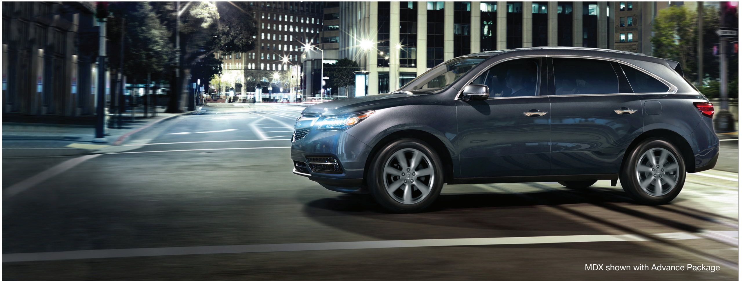
MDX shown with Advance Package