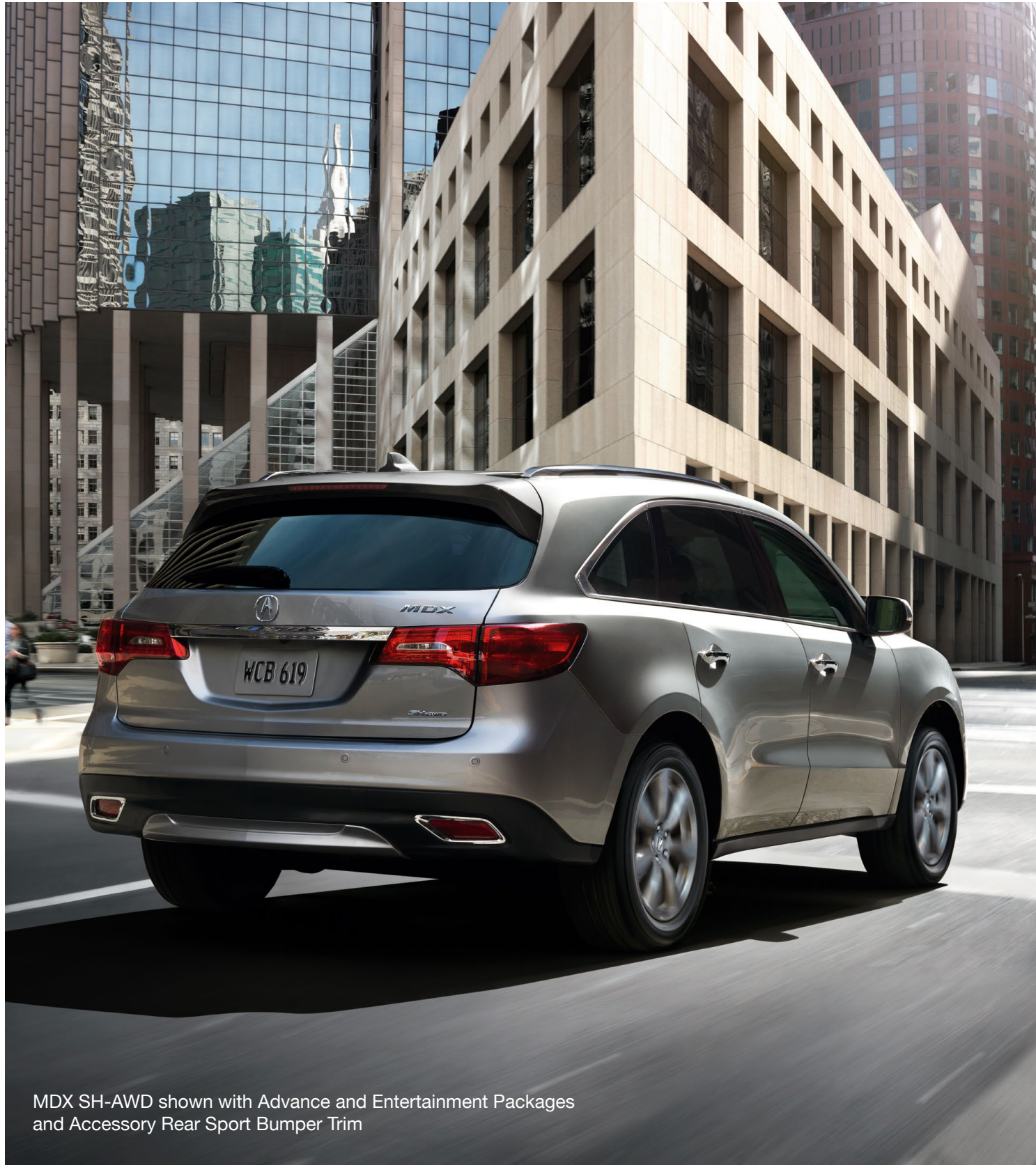
MDX SH-AWD shown with Advance and Entertainment Packages and Accessory Rear Sport Bumper Trim