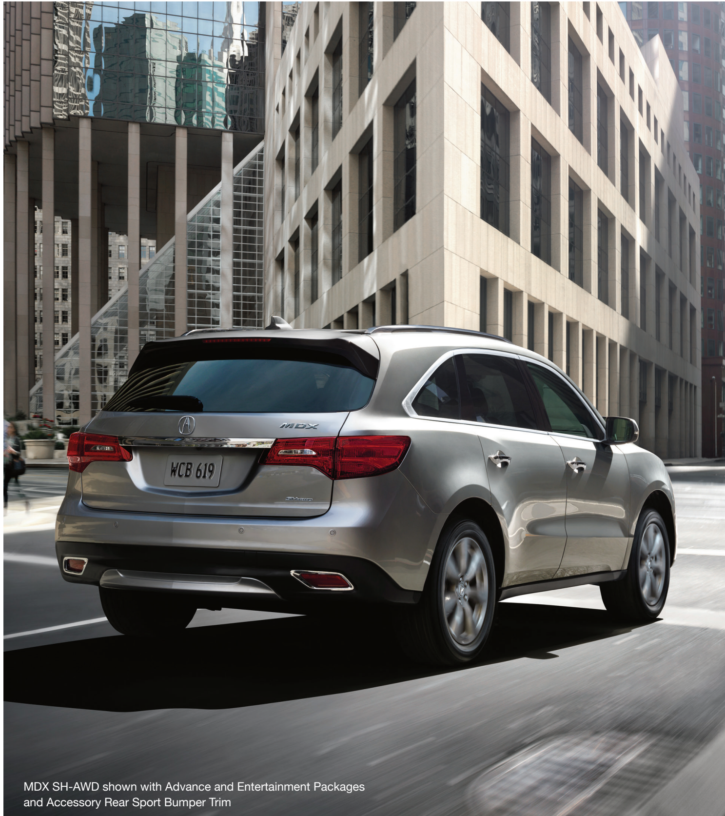
MDX SH-AWD shown with Advance and Entertainment Packages and Accessory Rear Sport Bumper Trim