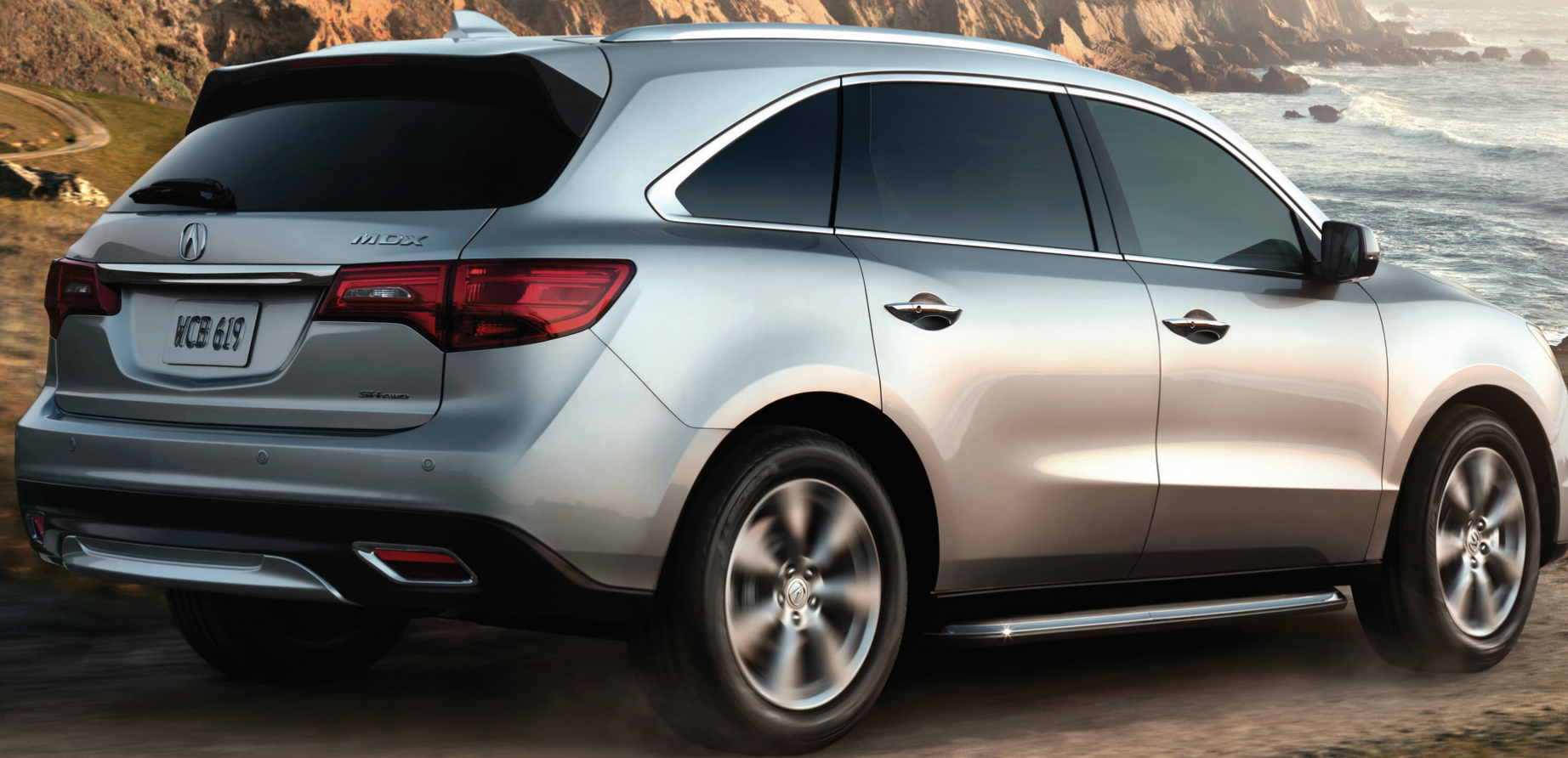
MDX SH-AWD shown with Advance and Entertainment Packages, Accessory Rear Sport Bumper Trim and Advance Running Boards