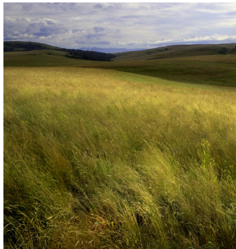
The Oregon Grasslands Project

Among the projects we're investing in is the Lightning Creek Ranch project in the State of Oregon, preventing the loss of North America's largest bunchgrass prairie. The investment would help landowners prevent farming that land and enhance natural carbon removal systems.