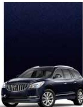
DARK SAPPHIRE BLUE METALLIC 1,2,3