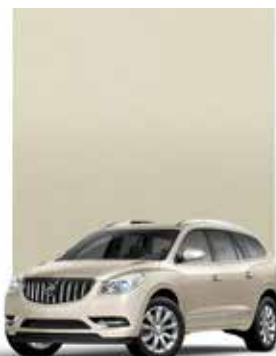
SPARKLING SILVER METALLIC 1,2,3