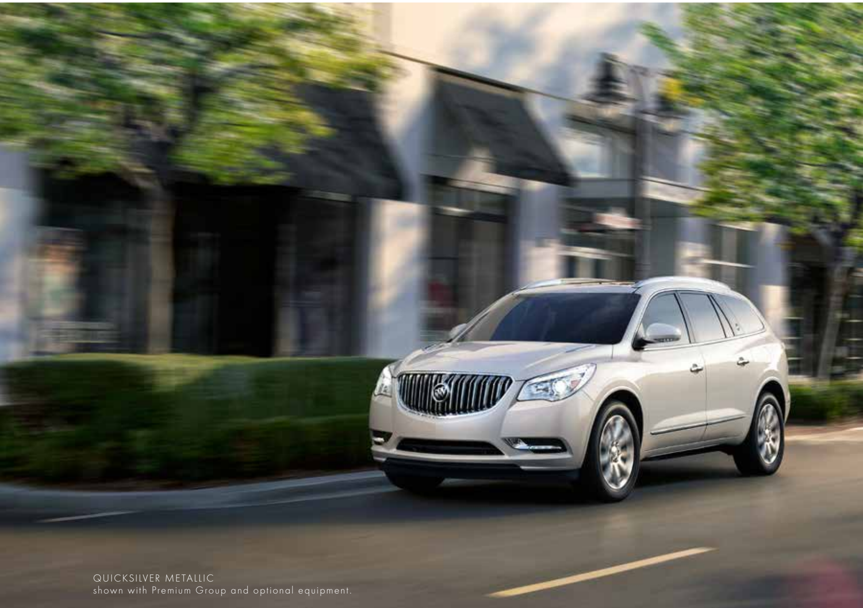
QUICKSILVER METALLIC shown with Premium Group and optional equipment.

The sculpted lines flow seamlessly from front to rear, letting you know this is no ordinary SUV. This is Buick Enclave, and it's time to DISCOVER THE EXTRAORDINARY story behind it— and experience for yourself how effortlessly it balances luxury and utility.