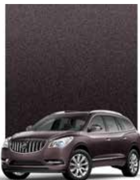
IRIDIUM METALLIC 1,2,3