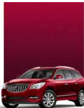
CRIMSON RED TINTCOAT 1,3