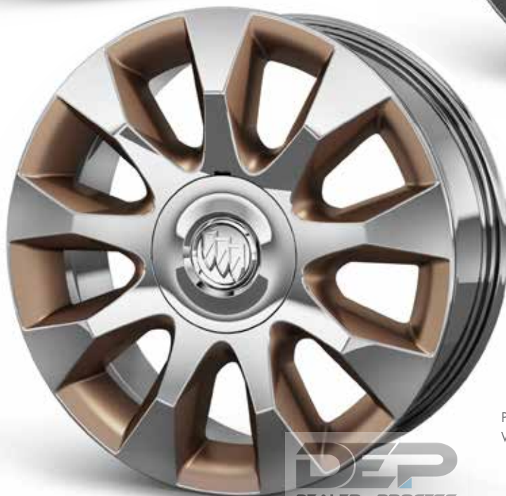
PPE 20" CHROME-CLAD CAST ALUMINUM WITH BRONZE POCKETS