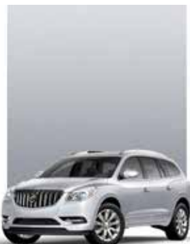
QUICKSILVER METALLIC 1,2