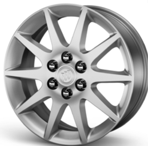
RZA 19" ALUMINUM 10-SPOKE