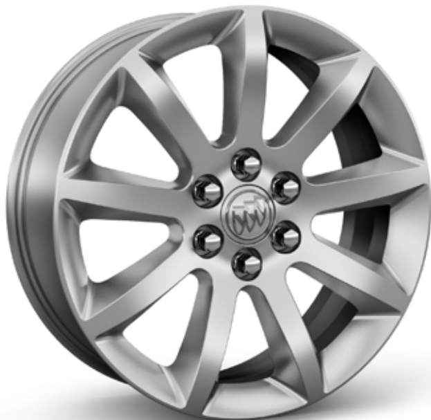
PEW 20" BRIGHT MACHINED ALUMINUM WITH BLADE SILVER POCKETS