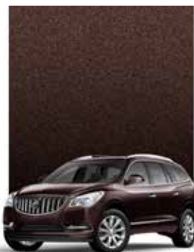
DARK CHOCOLATE METALLIC 2,3