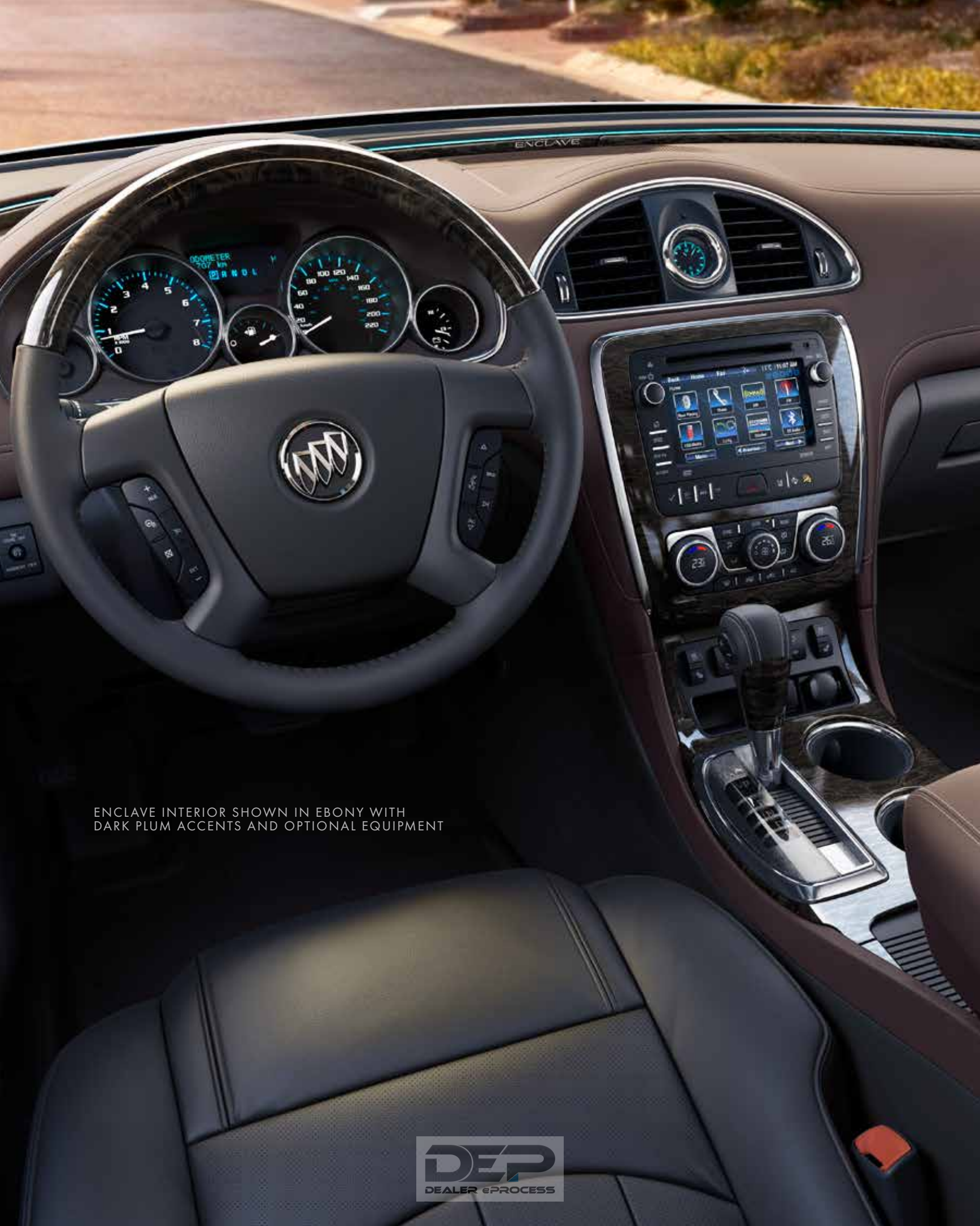
ENCLAVE INTERIOR SHOWN IN EBONY WITH DARK PLUM ACCENTS AND OPTIONAL EQUIPMENT