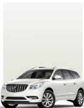
SUMMIT WHITE 1,2