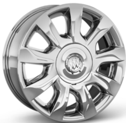
PJH 19" CHROME-CLAD CAST ALUMINUM