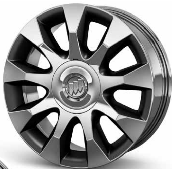
PJK 20" CHROME-CLAD CAST ALUMINUM WITH SATIN BLACK ICE POCKETS