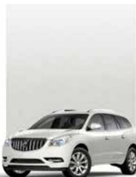
WHITE FROST TRICOAT 3