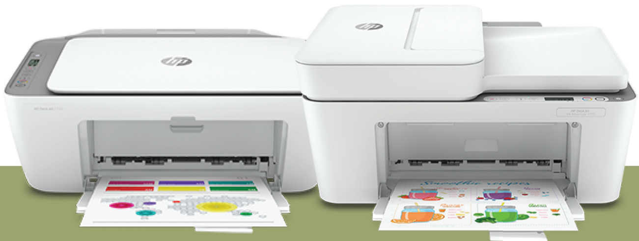
HP DeskJet 2700e