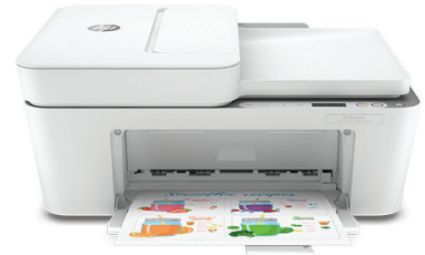
HP DeskJet 2700e series