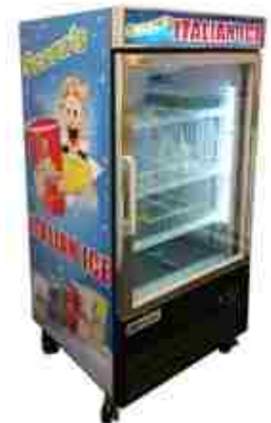
Height 1.5m/25" D238W

We can offer best quality upright display freezer.