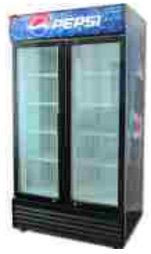
Top compressor type Fan assisted type