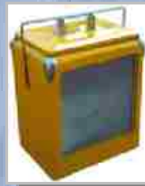
17L with window