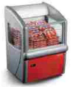
Freezer Box X2