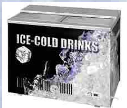
Chest Beer Froster