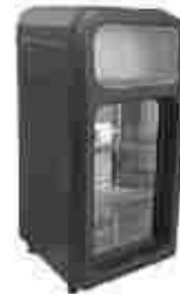
Retro Baby Cooler