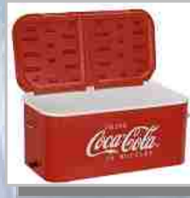
75L Double door