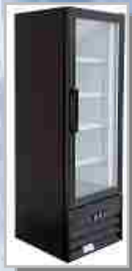
Cashier cooler without light canopy