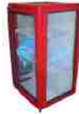
3 sided glass cooler