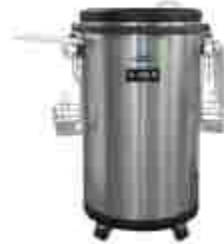
Stainless steel PC50SS