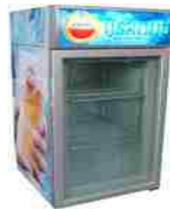
Countertop 172L D172