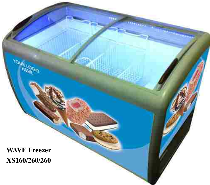
WAVE Freezer XS160/260/260