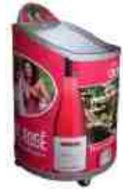
Open top CC48