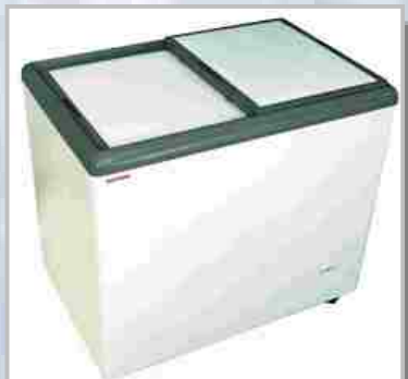
Solid sliding door freezer