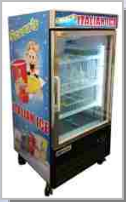
Cashier Freezer(height 1.5m)