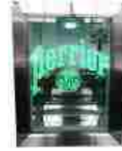
Stainless Steel finish