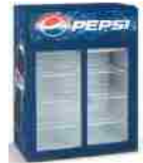
Mini Double Door

We have luxury cooler,star cooler, standard Cooler,basic cooler,four series countertop display cooler.