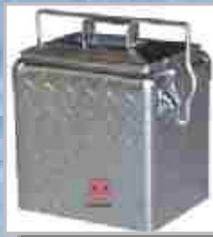
13L D/P(diamond plate)