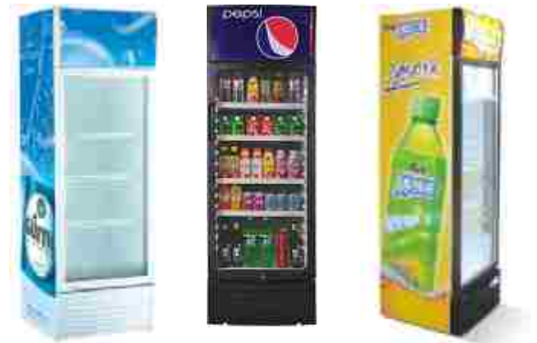
Asia/Latin America /Africa style

We have luxury cooler,star cooler, standard Cooler,basic cooler,four series single door upright display cooler.