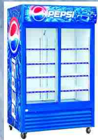
PEPSI1400 - Sliding door