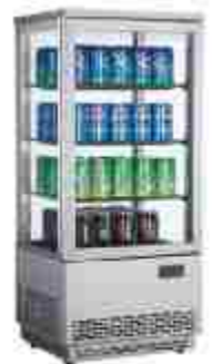
Pass-through door Stainless Steel finish

We have luxury cooler,star cooler, standard Cooler,basic cooler,four series 4 sided glass cooler.