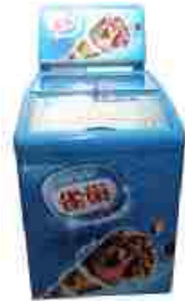
Front to back sliding lid SD136