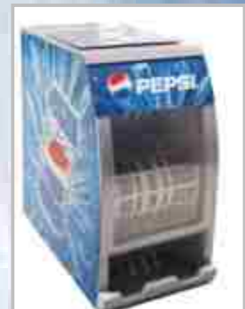
Can dispenser cooler