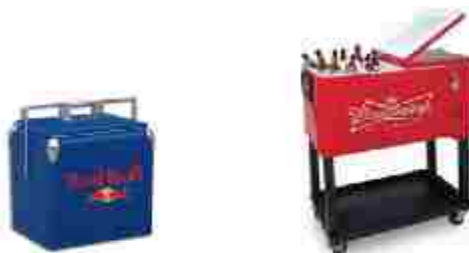
Cooler Box & Patio Cooler