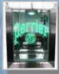
stainless steel fridge