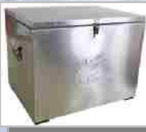
54L S/S(stainless steel)