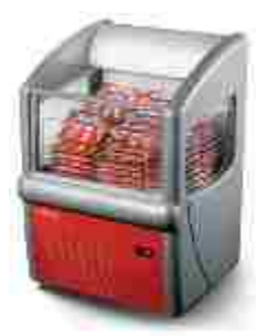
Cooler Box X1