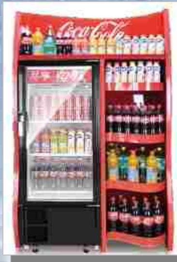
CK230A with rack