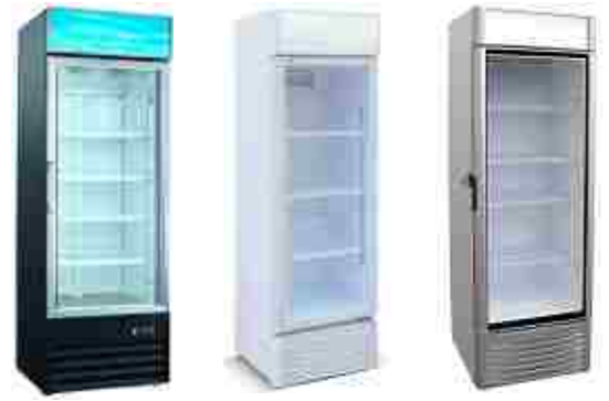
American and European style