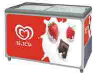
Flat glass SD250/350/450/650