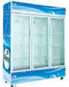
Low height 1.4m/54” Multi-doors

We have star cooler,standard Cooler,basic cooler,three series double door upright display cooler.