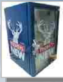
Safe box fridge