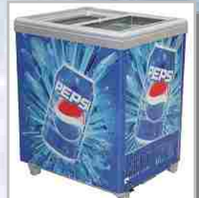
Rechargeable mobile cooler