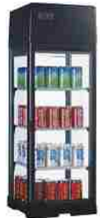
Full height 215/235/280/500L Top compressor T80