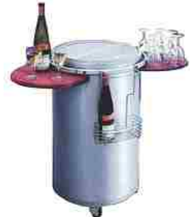
Party Cooler PC50A

We have luxury cooler,star cooler, Two series barrel cooler.