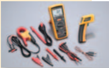
Fluke 1587 ET Advanced Electrical Troubleshooting Kit

Establishing preventative maintenance programs are becoming critical to maintaining the uptime of electrical equipment and can significantly reduce both planned and unplanned downtime. Unplanned downtime costs are difficult to calculate, but often significant. For some industries, it can represent 1 % to 3 % of revenue (potentially 30 % to 40 % of profits) annually.