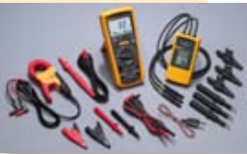
Fluke 1587 MDT Advanced Motor and Drive Troubleshooting Kit