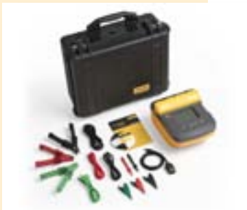
Fluke 1555 Insulation Resistance Tester Kit