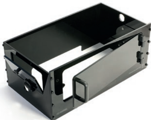
Figure 6. dissoGUARD Bath Shield

The dissoGUARD dissolution surveillance system possesses key features to help gather critical evidence in these situations. Not only do the individual cameras capture video and monitor key parameters, dynamic LEDs illuminate the individual vessels. This adaptive control is programmable using white or red lighting. An optional, easy-to-install bath shield delivers the perfect solution for light-sensitive applications. You are now able to completely conceal the apparatus, yet have recorded video of every second of every vessel.