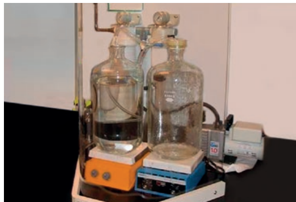
Figure 4. Typical laboratory deaeration setup according to the USP.