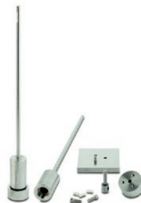
Figure 1. Intrinsic dissolution rotating disk components.

In addition to the dissolution apparatus, the analyst will require a benchtop press with an accurate pressure gauge, as well as safety glasses, an analytical balance, and weighing accessories.