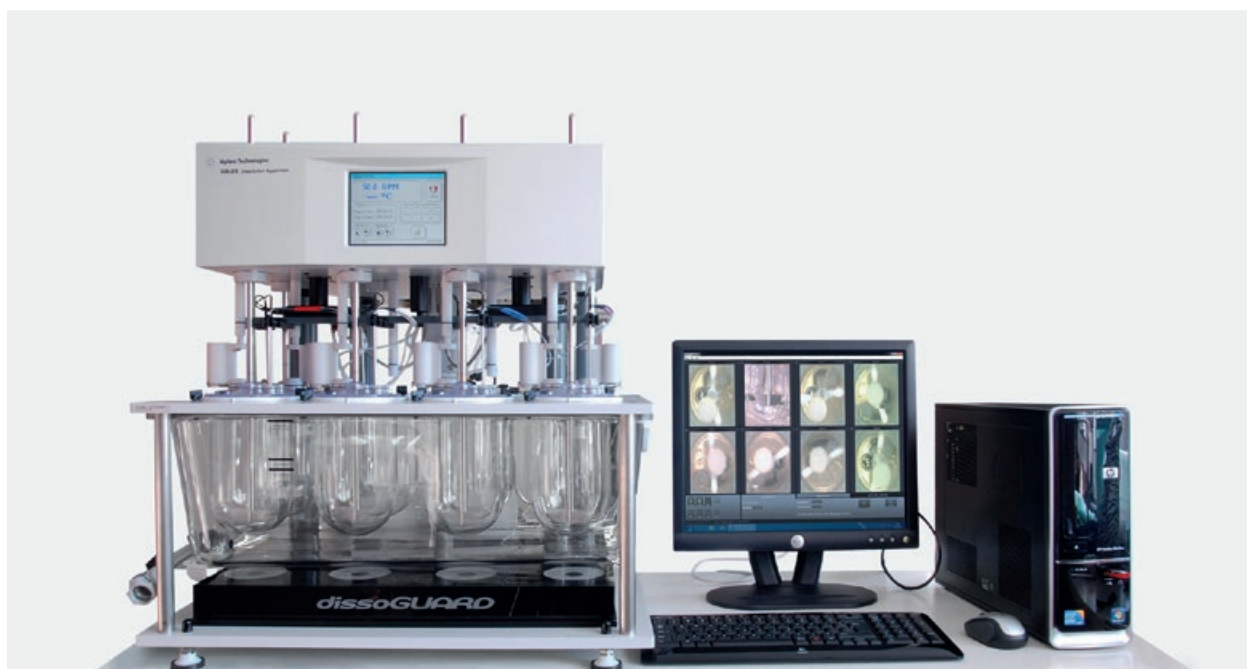
Figure 5. The dissoGUARD sits conveniently beneath the 708-DS, providing a view of each individual vessel.

“Visual observations are often helpful for understanding the source of the variability and whether the dissolution test itself is contributing to the variability.” -Excerpt from USP <1092>