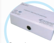
Convenient storage case