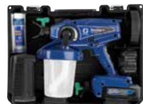
Part No. 16H240 Shown

The TrueCoat Pro Fine Finish cordless sprayer is designed specifically for small fine finish projects. This sprayer features a ProControl Pressure Control System that allows you to optimize the pressure setting for spraying a full range of fine finish materials – from stains to lacquers to enamels. Innovative design features make this a unique sprayer that is fully compatible with solvent-based materials including “hot” solvents.