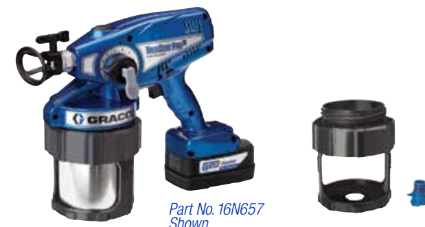
Part No. 16N657 Shown