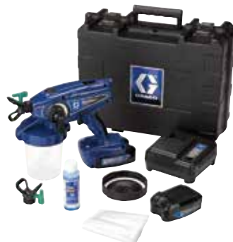
Part No. 16H240 Shown