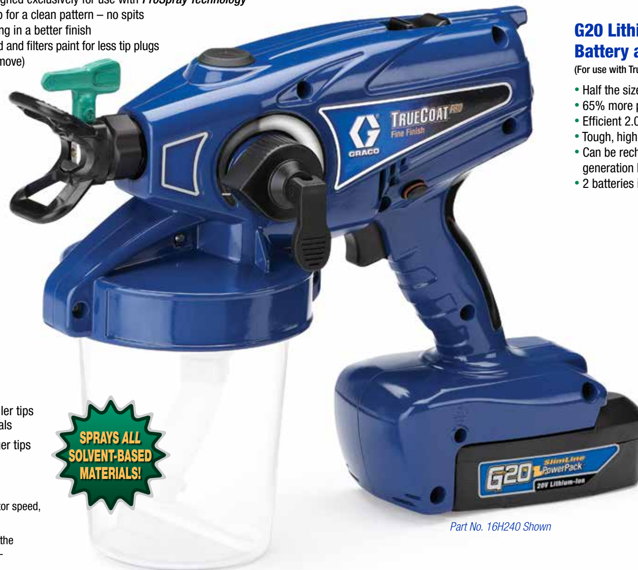
Part No. 16H240 Shown