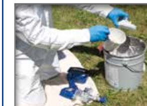
Dispose of cup liner and lid.