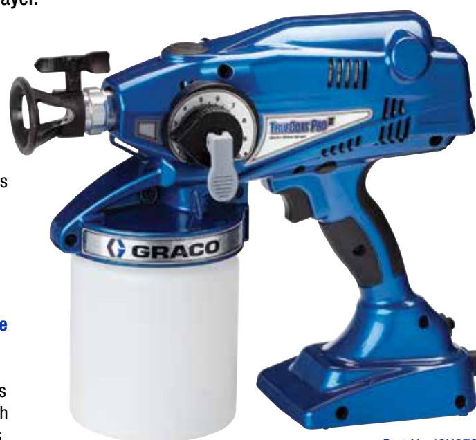
Part No. 16N673 Shown

High Pressure High production rate with thick materials