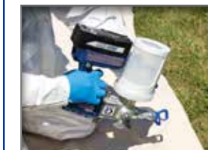
Attach cup with solvent, set to "Clean" and run upside down.