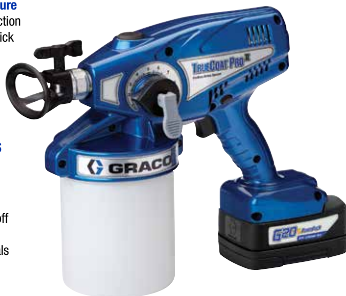
Part No. 16N657 Shown