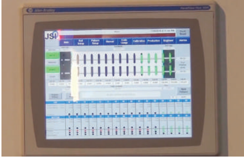
The machine HMI