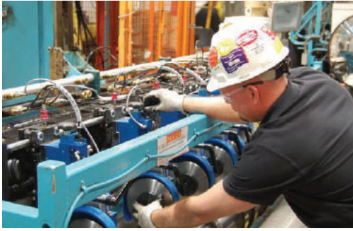
Changing slitter blades manually can be a dangerous task