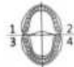
Four oral areas

When the electric toothbrush fails, please consult your local government how to dispose of this tool to maximize the protection of the environment