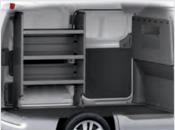
Base Shelving Packages Choose from four available shelving packages that include a 32" shelving unit and a steel or wire partition

COMMERCIAL UPFIT ALLOWANCE Available to eligible customers of TITAN® TITAN XD®, Frontier®, NV Cargo, NV200 Compact Cargo and NV® Passenger. Refer to your local Nissan Commercial Vehicles dealer for more information.