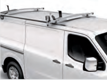
Complimentary EZ Load Ladder Rack Package Offered exclusively on Standard Roof models, this package offers a cargo partition and EZ Load Ladder Rack