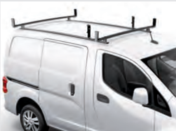
Complimentary Utility Package offers wire partition and 2-bar ladder rack