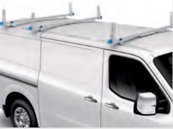
Complimentary Utility Package NV Cargo Standard Roof model offers a cargo partition and 3-bar utility rack

Business Certified Dealers offer a choice of interior shelving, exterior roof racks, and include a cargo partition wall, all from Adrian Steel®. Available on NV® Cargo and NV200® Compact Cargo.