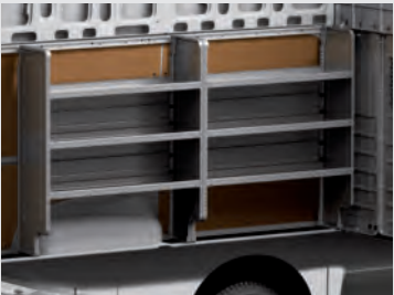
Complimentary Cargo Management System Package offers a cargo partition, a 4-hook bar with bracket, and three 44" wide Adrian Steel® Series shelving units