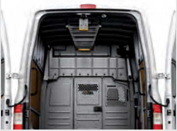
Complimentary Utility Package Offered exclusively on NV Cargo High Roof models, this package includes a cargo partition and interior overhead ladder keeper