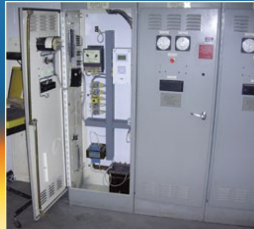
The same line-up with only a few components remaining