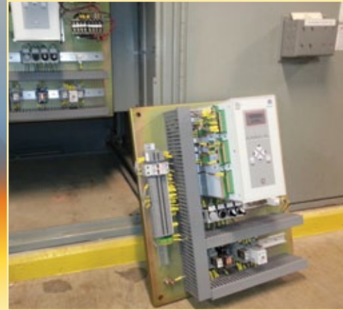
The same panel space fitted with a new digital exciter and power factor controller