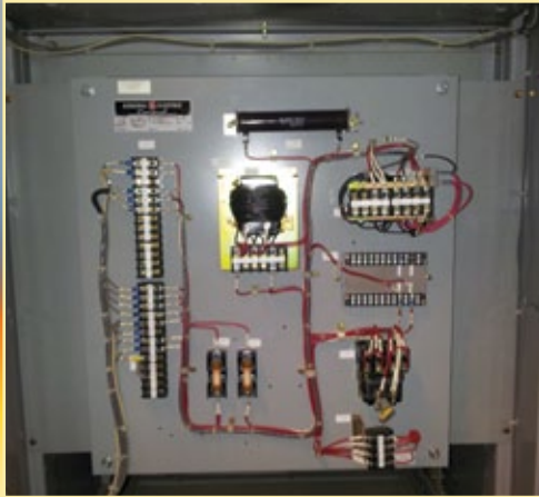
An analog, manual only, exciter control panel