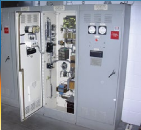
A typical '80s analog exciter control panel crowded with obsolete components