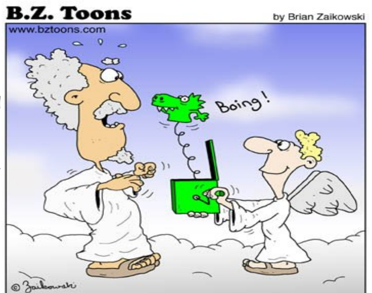
The Fear of God.

You can see this process going on in many ways in the world around you. Its kind of like recycling. You go out in the garden in the autumn and you pull up the flowers that are over, and put on them on your compost heap. In the compost heap the flowers rot down, creatures eat them up and shit them out again, and finally the compost is taken out the bottom and put back on the ground and soon more flowers are growing. Its straightforward to observe, but painful to contemplate when applied to ourselves, since it implies mind boggling, vast, cycles of death and birth. Here's a quote from the Buddhist writer, John Snelling: