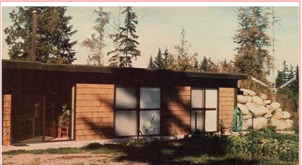
This IS the house that Jack built....