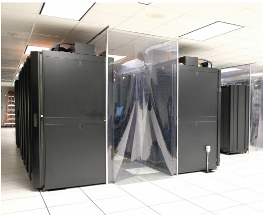
Figure 1. The Palmetto HPC infrastructure.