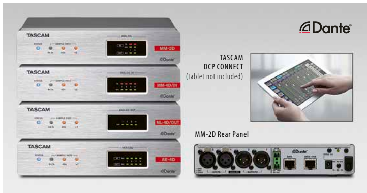
TASCAM DCP CONNECT (tablet not included)