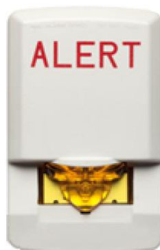
Model SLSWW-ALA Strobe