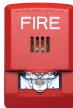
Model SLHSWR-F Horn-Strobe