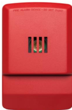
Model SLHR-N Horn

The 'SL'-series is apt for indoor wall-mount applications. The Model 'SLH'-series horn appliances work in either 12V or 24VDC, whereas the Series 'SLSW' and 'SLHSW' strobe and horn-strobe devices are specifically for 24V operation.