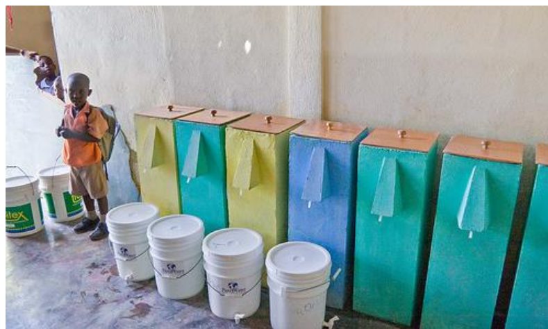
Slow sand filter system in Haiti Pure Water for the World

http://www.samaritanspurse.ca/ourwork/water/