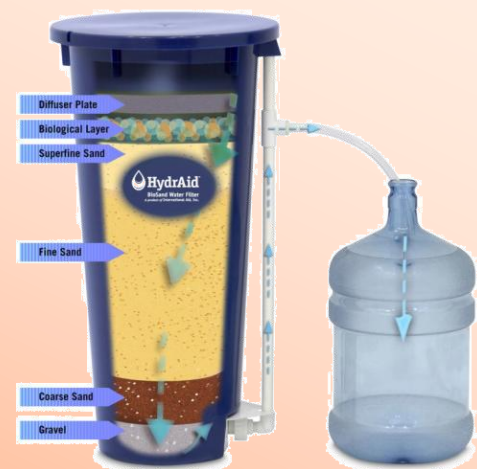
Commercially available slow sand filter HydrAid

Slow sand filtration is most appropriate where there is funding to subsidize the initial filter cost, available education for use and maintenance, locally-available sand, and a transportation network able to move the filter.