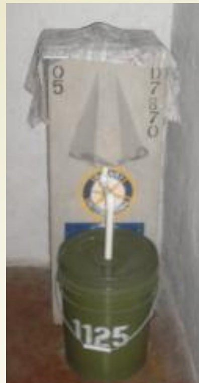
Locally-made concrete slow sand filter Pure Water for the World

There are several training centers that promote the SSF. The NGOs Centre for Affordable Water and Sanitation Technology (CAWST) and BushProof both offer training, implementation manuals, and assistance to organizations interested in starting SSF programs.