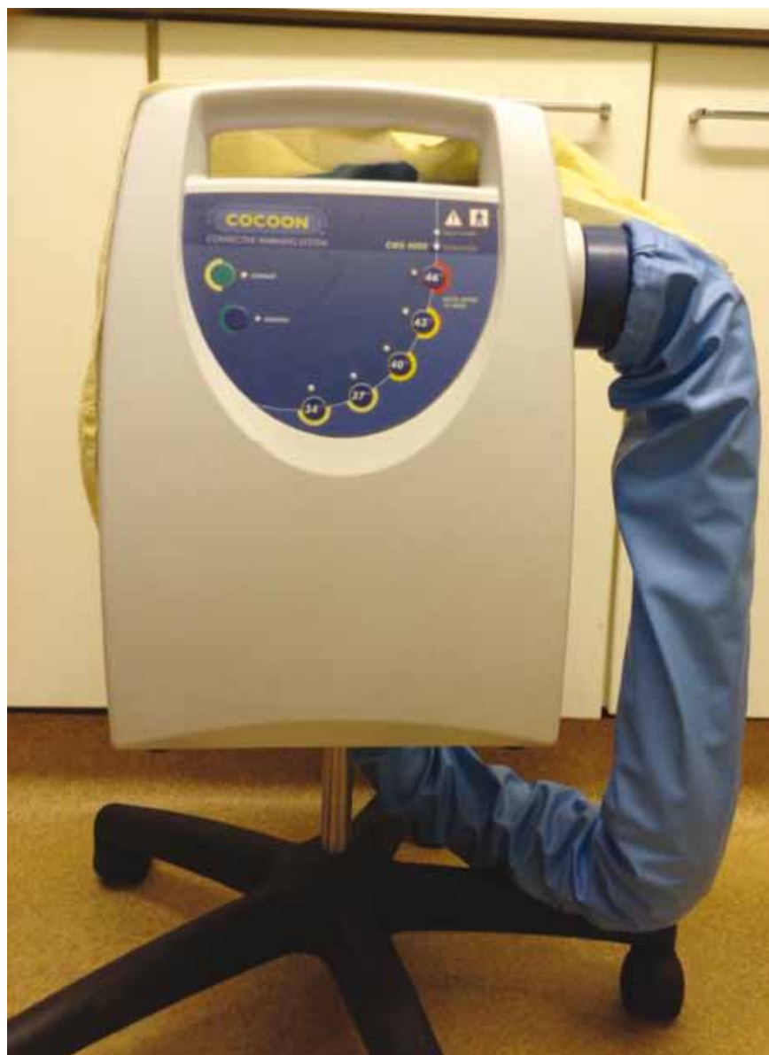
Figure 4. Patient warming device.

by electric heat pads, hot water bottles or 'hot hands' (latex gloves filled with warm water), as thermal burns are possible especially in the recumbent patient. The towel underneath the patient acted as an insulation layer to prevent heat loss via conduction. Lamb (2009) describes other methods of insulation such as bubble wrap, material or foil blankets which she advises can reduce heat loss by 30%. Pre-warmed intravenous fluids were used to encourage active core warming. A study carried out by Dix et al (2006) highlighted the importance of actively maintaining the temperature of the fluids rather than just pre-warming them due to the heat loss that occurs as the fluid travels down the giving set. The most effective results were achieved by pre-warming the fluids and the giving set to 38°C, using a fluid heat retention bag over the bag itself and wrapping 30 cm of a distal portion