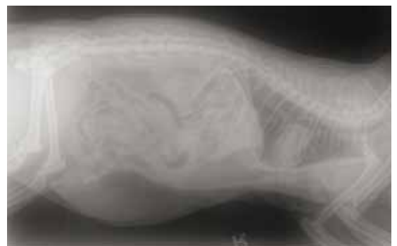
Figure 1. The patient had a dislocated hip and abdominal rupture, revealed on radiography.

The aim when treating hypovolaemic shock is to restore and maintain adequate circulating intravas-