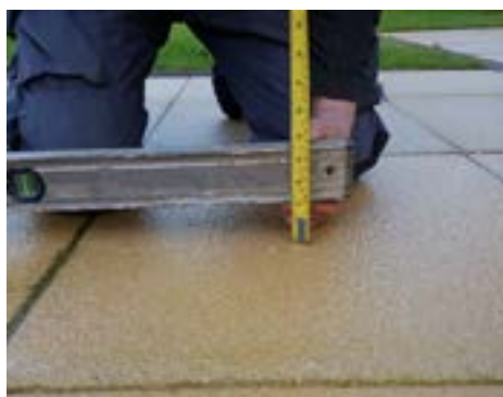
An unlevel base means the structure walls will not sit square to the floor. This will cause the structure to be unsecure and pull apart over time.