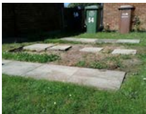
Not level due to sub soil movement beneath ground and gaps between the slabs.