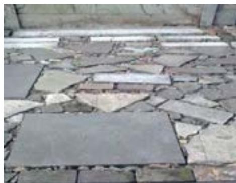
A mixture of broken slabs with no cement filled gaps.

The example images below show unsuitable bases which would result in an aborted assembly.