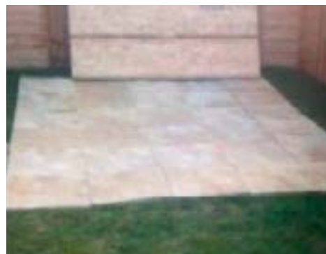
Unevenly lying slabs directly on top of a lawn.