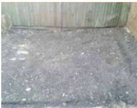
A base of soil only.