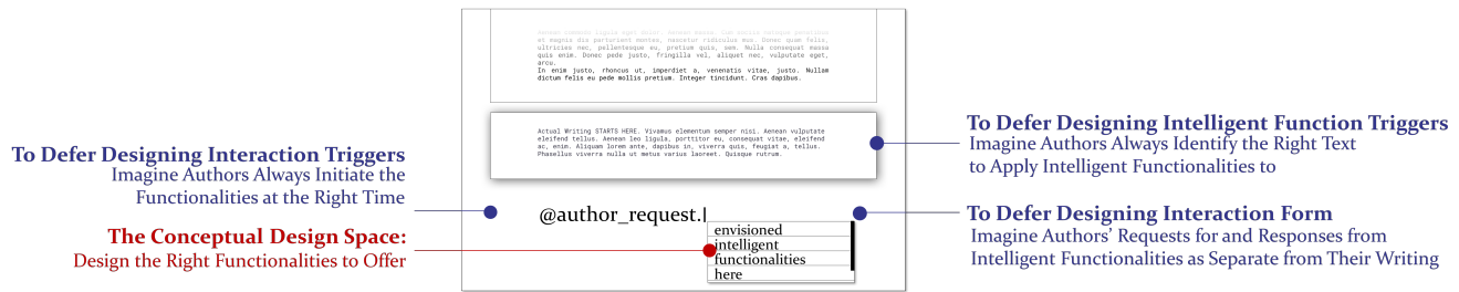
Figure 1: “The notebooks” as a form of wireframe for sketching abstract, language-based interactions. It bounded us to focus on envisioning “the right thing to design” and deferred detailed interaction design tasks.

record their screen for 40 minutes as they were writing one of their own documents. We then conducted an 1-hour interview. Participants walked us through their thought process in writing during the time of screen recording and discussed their unmet needs and wants toward writing assistance.