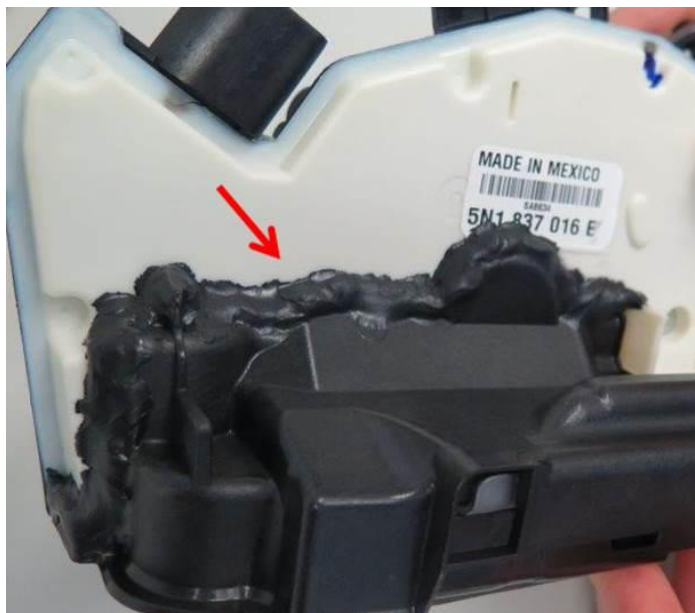
Figure 6: (Example: butyl sealing cord pressed down/spread out by hand).