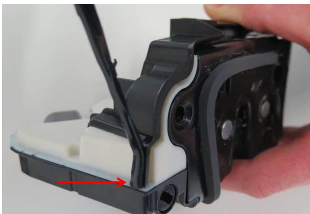
Figure 3: Starting position for routing Butyl sealing cord.