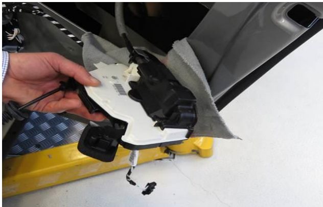
Figure 1: Door lock and cap assembled.