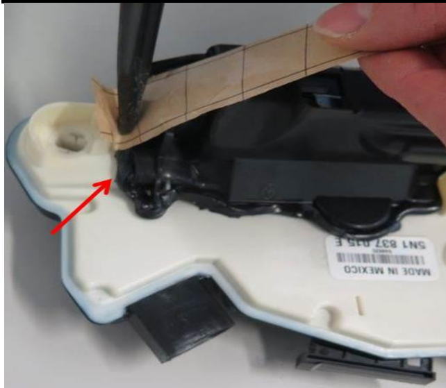
Figure 5: pressing down Butyl sealing cord with suitable tool.