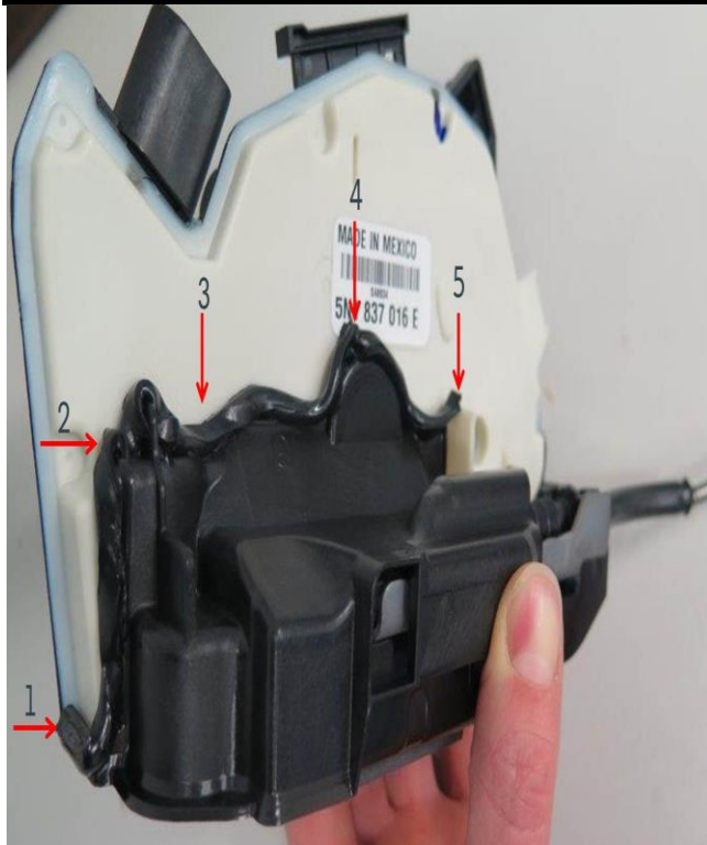
Figure 4: Area where Butyl sealing cord has to be routed.