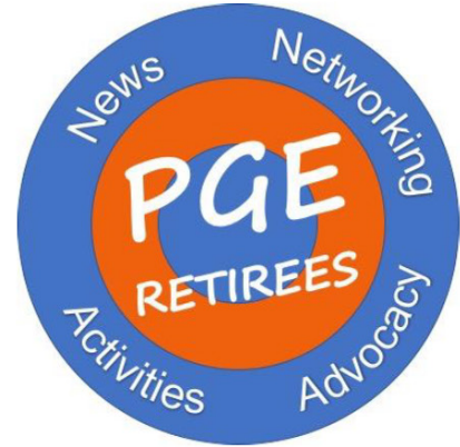
Figure 1, Temporary Logo