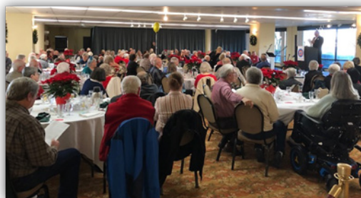
We all had a great time!