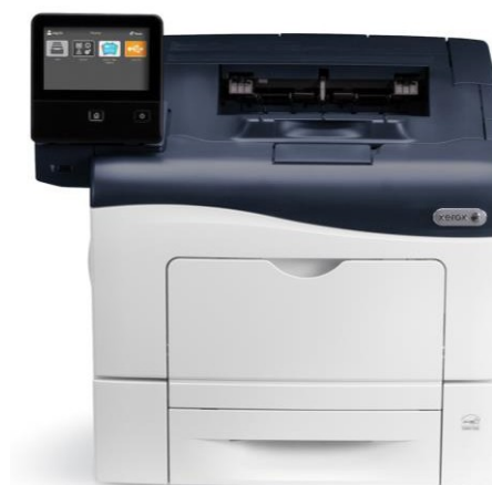
C405 Color Multifunction Printer