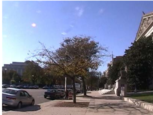
Figure 4: Best Match for a Run that Required High Values of Imageability, Linkage, and Tidiness

The first wave of the visual assessment survey (32 clips) was conducted electronically. The sample of video clips was recorded in random order onto DVDs, and the DVDs were distributed to expert panel members. A telephone survey was then conducted in which the panel member and a research team member viewed each clip concurrently, the panel member assigned scores to each clip and commented on the specific features of scenes that produced high or low