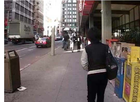
Figure 5: Best Match for a Run that Required High Values of Enclosure, Transparency, and Complexity

To expand the sample, a second visual assessment survey (16 additional clips) was conducted face-to-face at a meeting of the expert panel. For this survey, clips were also in random order. Panel