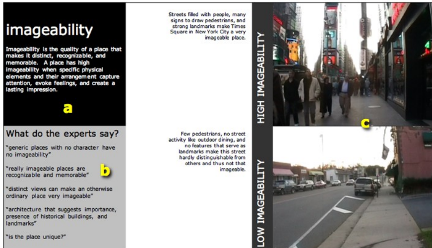
Figure 6: Introduction to One Urban Design Quality, Imageability