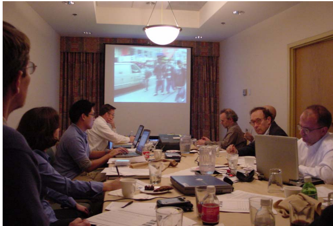
Figure 2: Visual Assessment Survey During Expert Panel Meeting

In terms of the public realm, no element of the urban environment is more important than streets. This is where active travel to work, shop, eat out, and engage in other daily