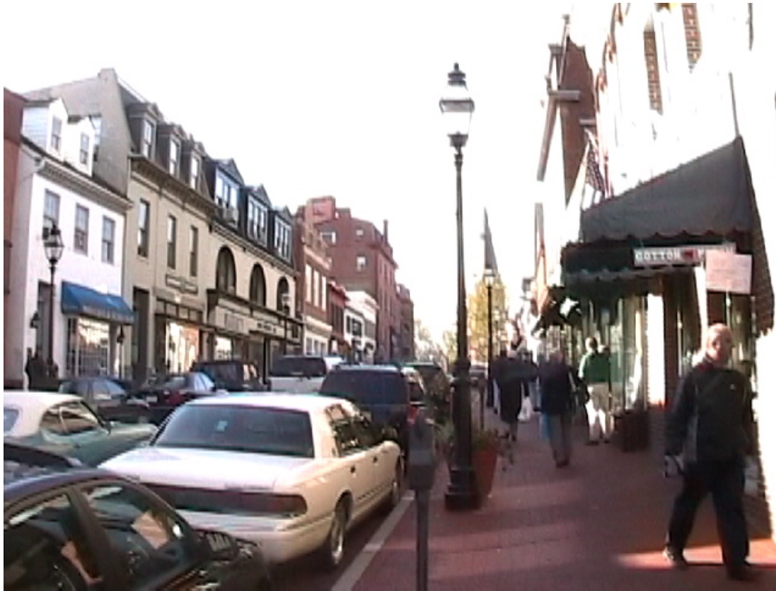
Figure 3: Best Match for a Run that Required High Values of All Eight Qualities

the desirable properties of being both balanced and orthogonal.