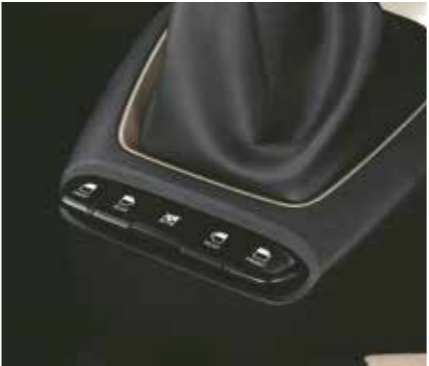
Ergonomically positioned power window switches