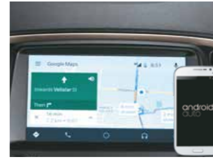
Android Auto connectivity