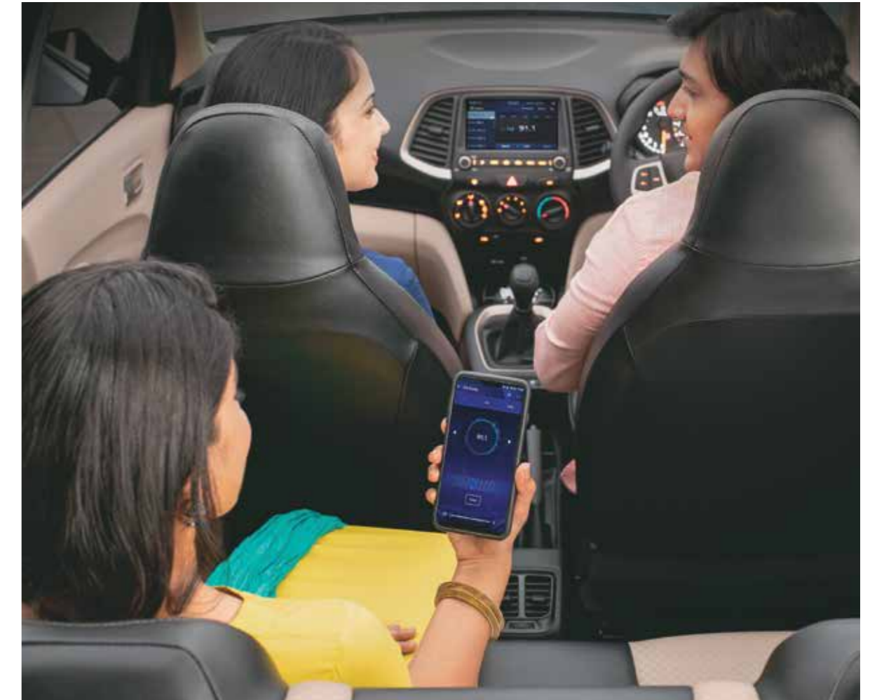
Hyundai iBlue smart phone app for audio remote control*

Other features: 17.64cm Touchscreen audio video system with smart phone connectivity | Mirror link