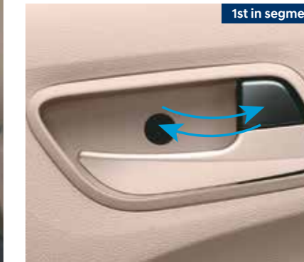
Speed sensing auto door lock & Impact sensing auto door unlock