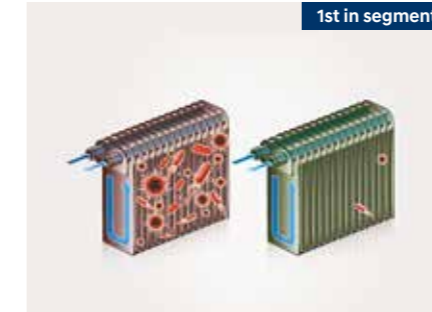
Eco coating technology