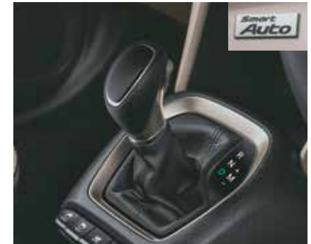
Smart auto AMT