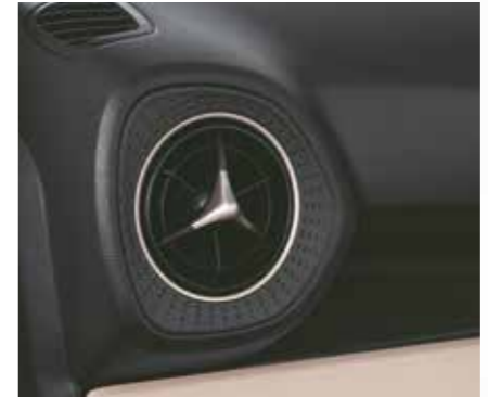
Unique propeller design air con vents