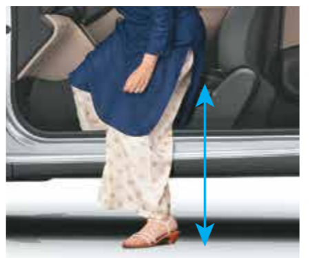
Spacious cabin with easy ingress/egress