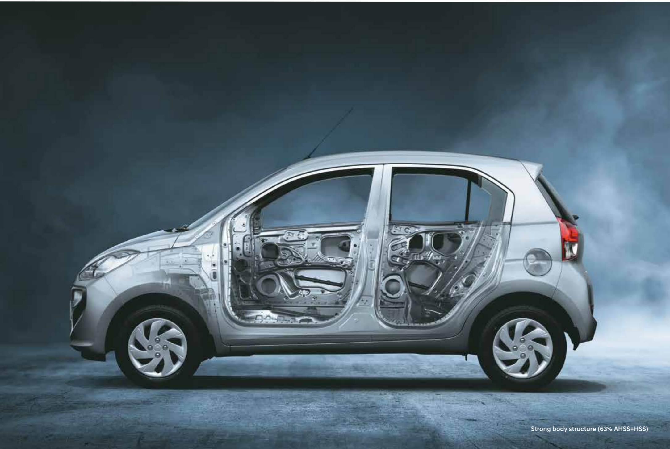
Strong body structure (63% AHSS+HSS)