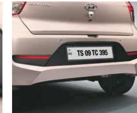
Dual tone body color bumpers with reflectors

Other features: Body colour door handles | R14 steel wheel with cover | Z-Shaped character lines