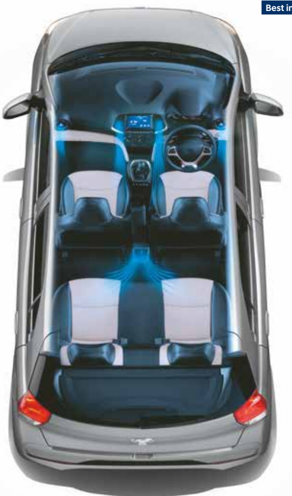
Superior AC performance

Other features: Floor mat hook | Passenger vanity mirror