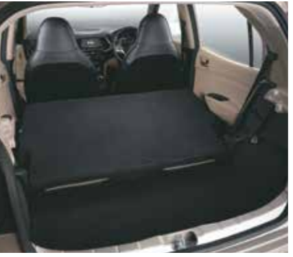
Rear seat bench folding