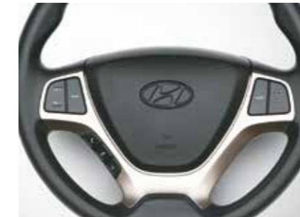
Steering mounted audio & Bluetooth controls