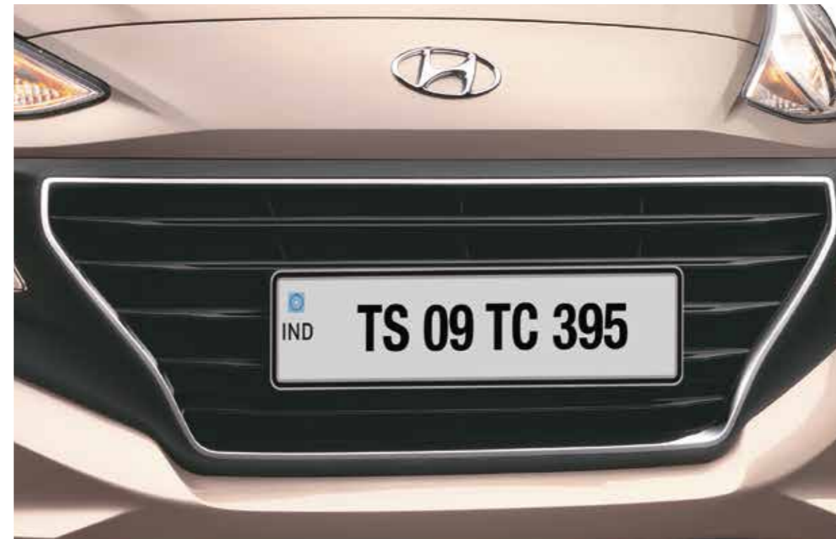
"Cascade design" chrome front grille

Designed for the entire family's pleasure, Santro comes with a modern design and a confident stance. While you relish its unmistakable cascade grille, high perched fog lamps, stylish headlamps and tail lamps, let others admire the modern and unique Z-shaped character lines.