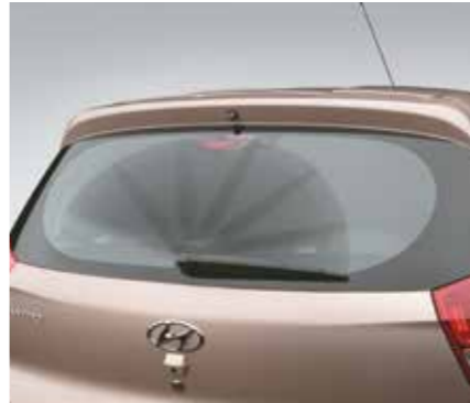
Rear washer & wiper