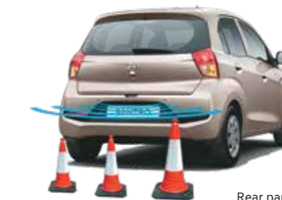
Rear parking sensors

Other features: Driver seat belt reminder