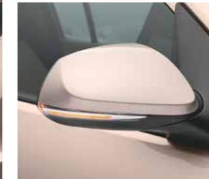
ORVM with electric adjustment & turn indicators