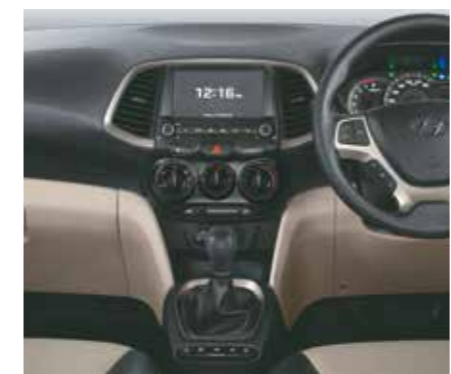
Elephant inspired unique centre fascia

The Santro offers more room for the entire family and their growing needs. Now you will find long drives more enjoyable and less tiring.