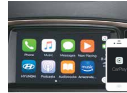
Apple CarPlay connectivity