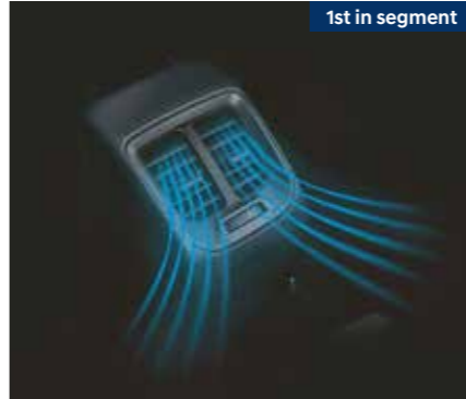
Rear AC vents