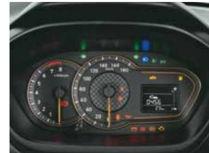
6.35cm Advanced cluster with multi Information display (MID)