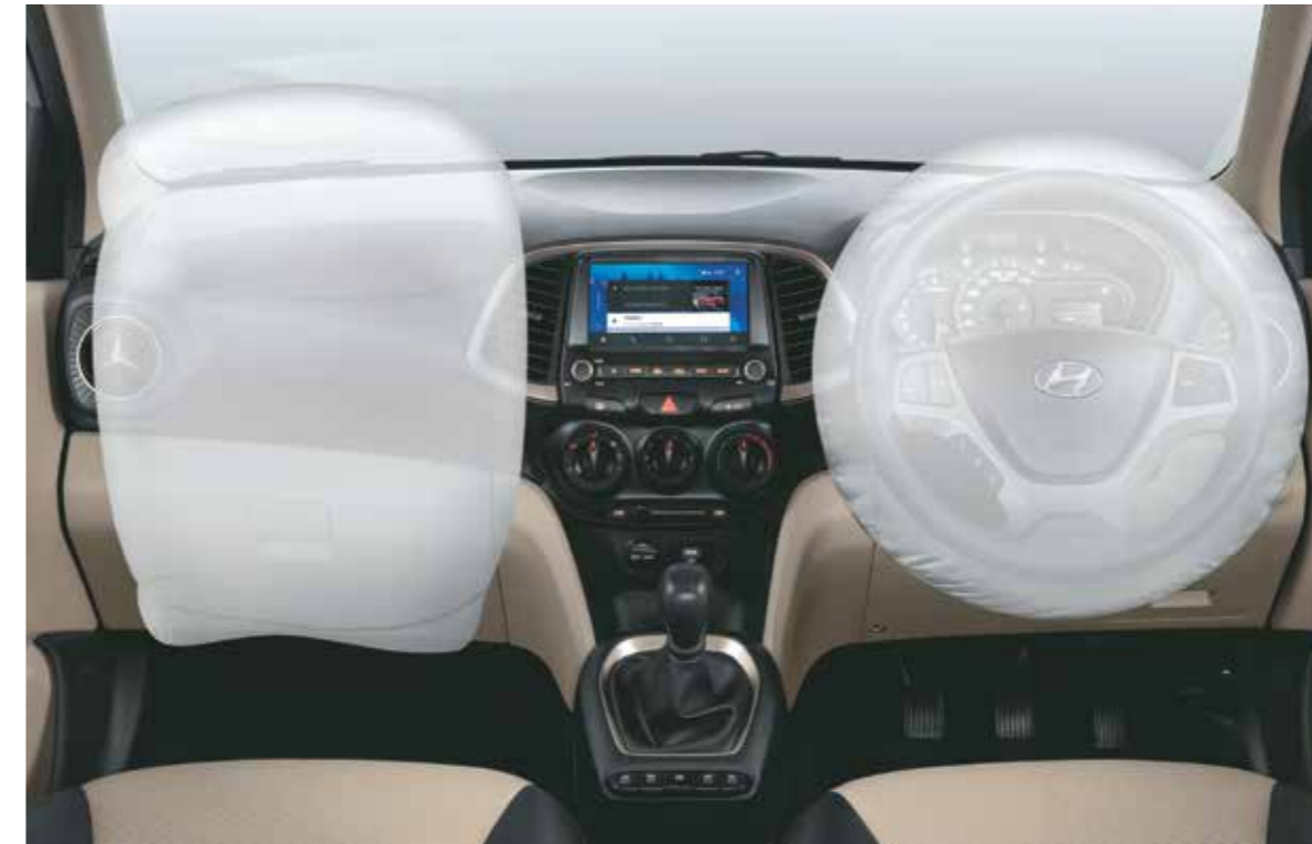
Dual front airbags