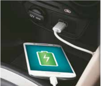
Power outlet & USB port

The Santro is thoughtfully designed for the comfort and convenience of your loved ones. Its ergonomically crafted interiors with champagne gold inserts and a host of features enhance the overall driving experience.