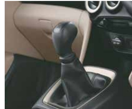
5-speed manual transmission