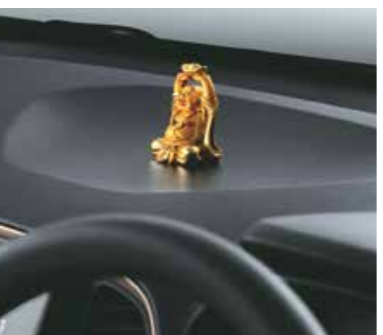
Idol keeping space