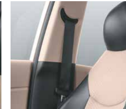
Front seatbelt pretensioners with load limiters