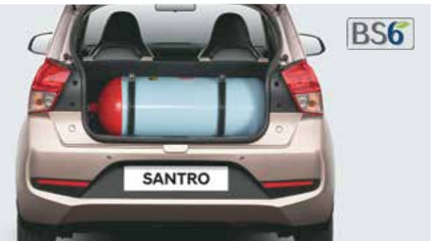
Convenient CNG filling (near petrol fill area)