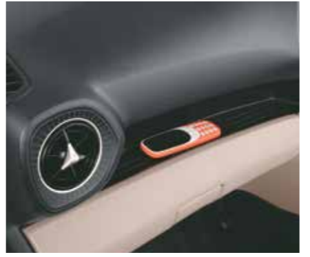
Practical storage area