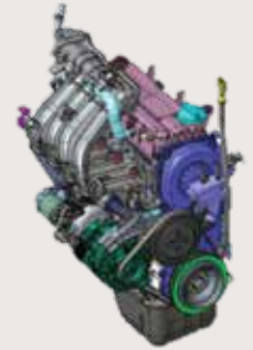
4 Cylinder petrol engine