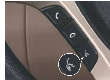
Voice recognition button on steering