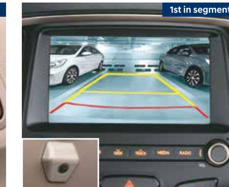
Rear parking camera with display on 17.64cm audio video screen

Other features: Driver seat belt reminder