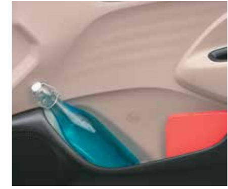
Map pocket with 1l bottle holder