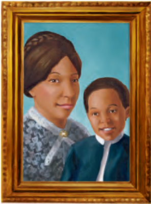
TANTE OCTAVIA AND RENÉ

Maman's widowed sister and her son, who live with Cécile's family