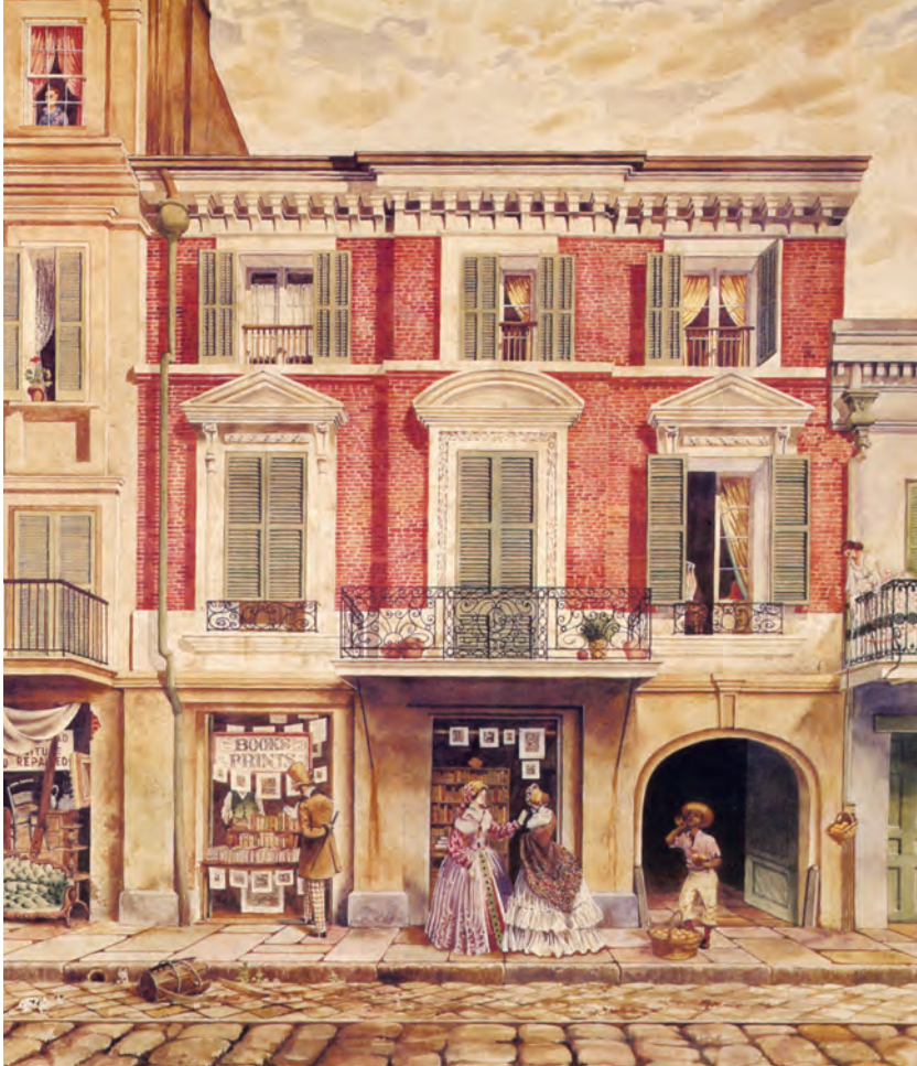
A street in the heart of New Orleans around 1850. To most visitors, the city looked and sounded more French than American.

In 1853, when Cécile's story takes place, Louisiana had been part of the United States for fifty years. Yet New Orleans, Louisiana's biggest city, was remarkably different from any other city in America. Visitors from other states noticed the differences immediately: the sound of French being spoken in streets and shops; the