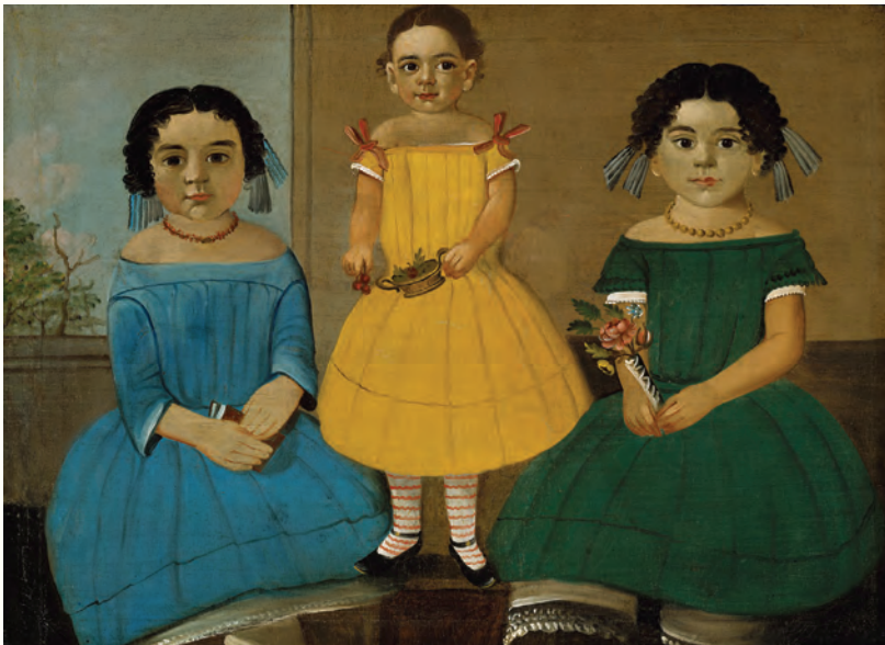
Free girls of color in 1854

For much of the early nineteenth century, New Orleans stood out as a place where people of color enjoyed more freedoms than anywhere else in America.