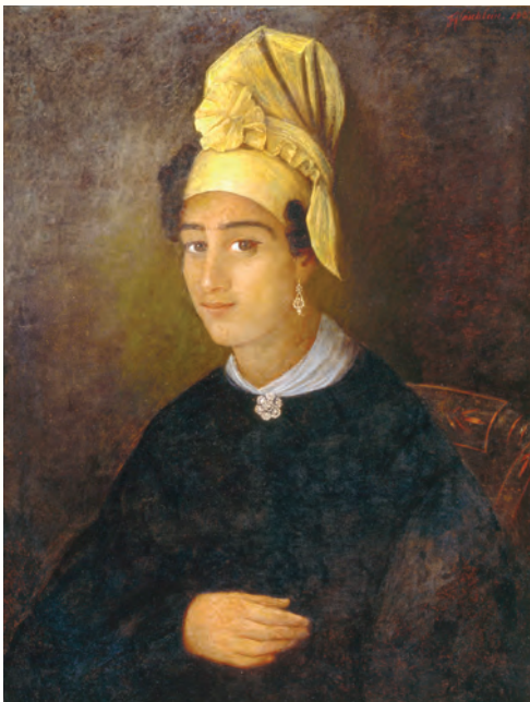
Wearing a turban or head wrap called a tignon (tee-yohn) was a stylish way to show pride in being a woman of color. The custom grew out of a time when women of color in Louisiana had been required to wear head scarves.

New Orleans' free people of color took pride in their unique identity. Public squares in certain neighborhoods—especially Congo Square in the Tremé neighborhood—became gathering places where people of color socialized and where musicians and dancers performed in the