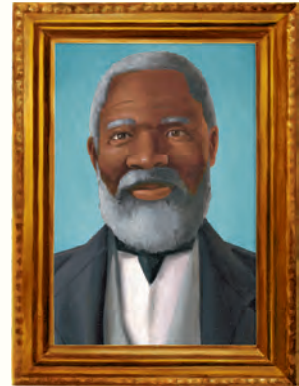
G R A N D - P È R E Cécile's loving grandfather, a retired sailor with many tales to tell