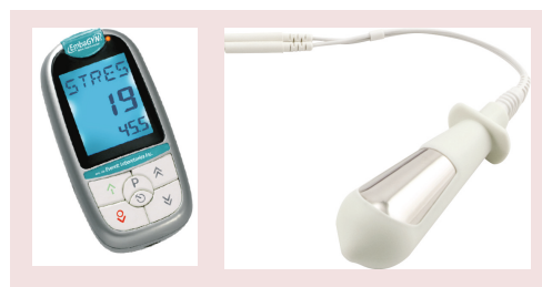
Figure 1. The EmbaGYN™ Pelvic Floor Muscle Stimulator.

Patients who met inclusion and exclusion criteria, including acceptable ( \geq 90\% ) compliance with e-Diary procedures, completed the Incontinence Quality of Life Questionnaire. This is a disease-specific, self-administered questionnaire for measuring incontinence-related quality of life that consists of 22 items (such as “I worry about not being able to get to the toilet on time”; “I worry about coughing or sneezing because of my urinary problems or incontinence”) that are ranked on a 5-point scale ranging from 5 (not bothered at all) to 1 (extremely bothered) and transformed to a scale score ranging from 0 to 100 for ease of interpretation, with higher scores indicating better incontinence-related quality of life [22–24].