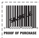
Sample UPC code. UPC code is located on the side panel of product packaging.

Customer Service Phone Number: 1-800-589-3720