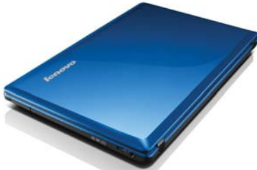
Lenovo G480/G580 Blue (Glossy)