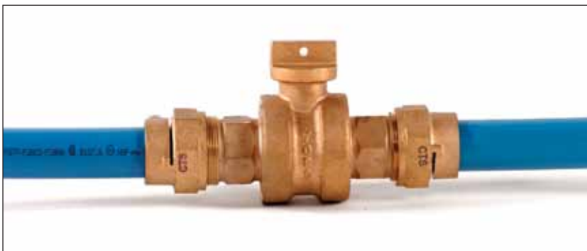
A final assembly with cross-linked polyethylene pipe in a compression joint curb stop that is compliant with AWWA C800, Standard for Underground Service Line Valves and Fittings.

Slow-crack-growth resistance. PEX piping is resistant to slow crack growth and environmental stress cracking when used in typical potable water systems. In rocky soils, PEX