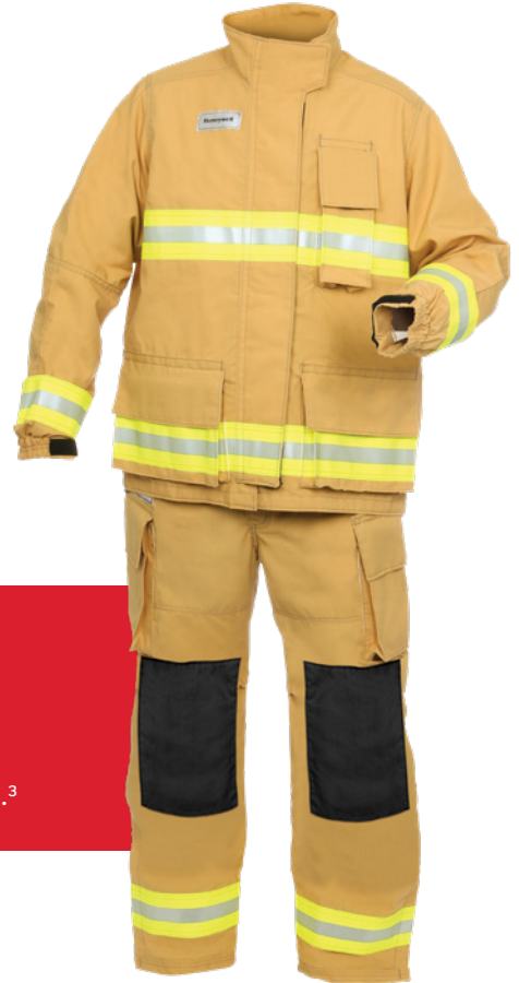
*Image shown with additional options

Honeywell Multi-Response Gear was developed to provide firefighters and emergency medical technicians (EMTs) with certified gear that is comfortable and less bulky than TOG, yet maintains quality protection during non-fire calls. Lighter-weight gear means you expend less energy, which lowers your risk of overexertion. Whatever your needs, Honeywell Multi-Response Gear can be configured to your requirements.