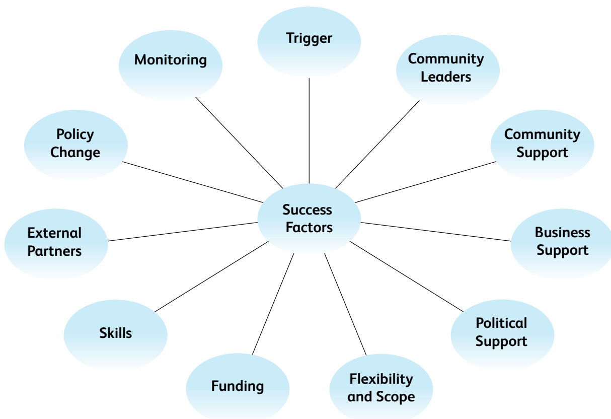
Chart 1: Community Project Success Factors

But from across the eight case studies a number of factors can be identified as being particularly significant. It is by no means essential for a project to have all of these ingredients if it is to succeed – and different factors are likely to be more significant at different stages in the development of a project. Indeed, it is worth noting that while some of the case study projects have been running for nearly 15 years, others have been going for less than two – and each project has needed different factors to come into play at different stages. Nevertheless, the more of the ingredients a project has at appropriate points during its ‘life cycle’, the higher its chances of success will be.