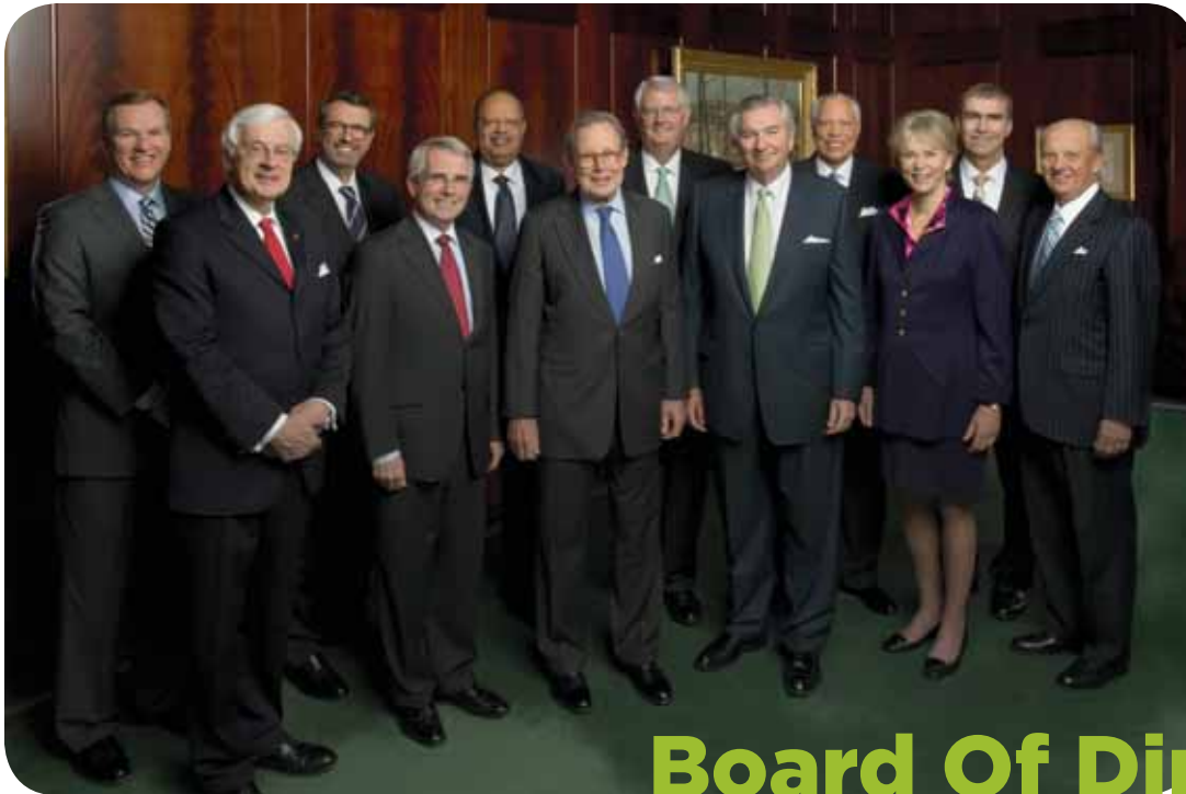
Norfolk Southern's board of directors