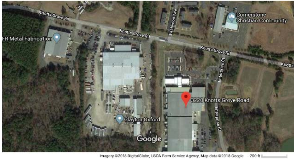
Figure 1. Location of the Manufacturing Facility

The manufacturing facility is located in Granville County in the Fishing Creek subwatershed, hydrologic unit code 03020101, in the Tar River basin. 1,2 The facility is surrounded by woodlands; bounded by a residential area to the north; mixed use residential and commercial lands, and Interstate 85 (a four-lane, divided highway) to the west; and a fresh produce farming establishment to the southeast.