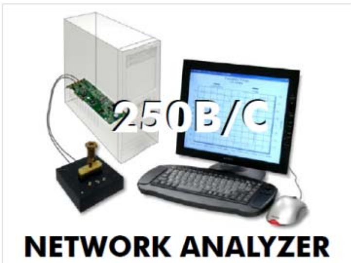
Figure 1. 250B/C Network Analyzer

A simple analysis in sweeping the drive level can be performed to verify changes in both resistance and frequency of the crystal. This analysis, typically called Drive Level Dependence (DLD), can be taken using a Saunders & Associates (S&A) 250B/C desktop network analyzer. Refer to figure 1. S&A manufacturers test and production systems for quartz crystals, oscillators, filters, and components. It has become an industry standard and preferred test system by many of the leading crystal manufactures. This desktop system is relatively inexpensive and is essential if designing or using silicon component, which require quartz crystals.